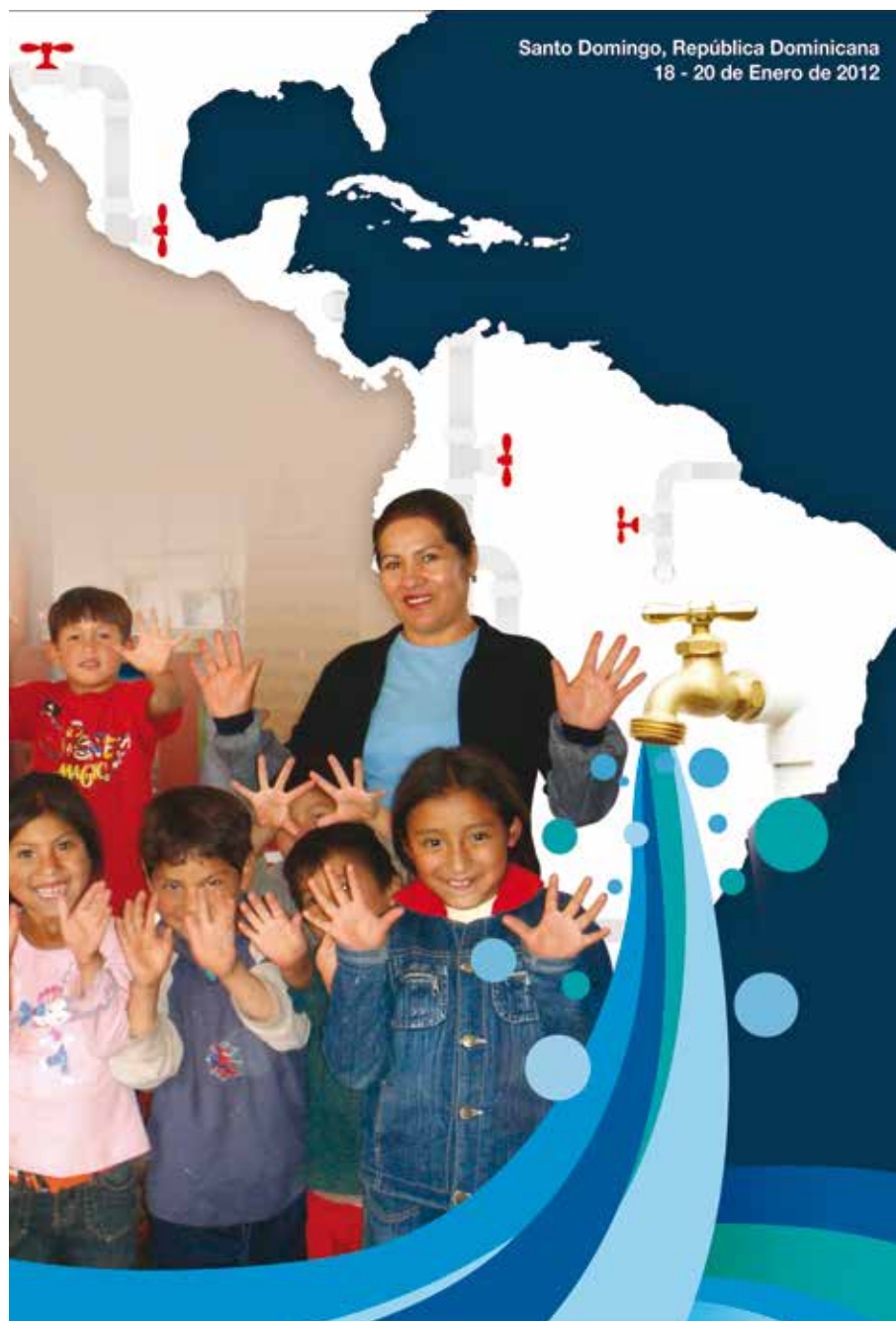
Banner of the event "Beyond Infrastructure: Integrating Hygiene in Water and Sanitation Policy in Latin America and the Caribbean" – Santo Domingo, January 18th and 19th, 2012.

There are several approaches that have been used to change prevailing practices or bring about change in behaviors of a family, such is the case of UN-HABITAT that developed a simple and easily understandable set of messages that are organized and communicated in a manner relevant to improvement of water and sanitation facilities throughout the project cycle. UNICEF's WASH program in schools (in LAC ESCASAL in Honduras or IEAS in Nicaragua) uses an effective approach that targets messages to specific audiences based on their motives towards adopting new behaviors.