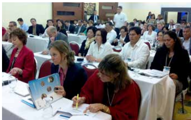
Attendees of the event

Most Latin American countries are undergoing decentralization, albeit at different paces. There is a growing need to support authorities at national and local level to design sound policy that will translate into operational level budget allocation to reach audiences and bring about change, with well defined roles, responsibilities and operational