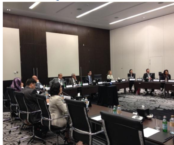
Participants at the Workshop on the Iraqi Financial Sector Legal and Regulatory Framework Workshop in Abu Dhabi (December 2013)

Financial inclusion - the proportion of individuals with access to formal financial services including credit, savings, and insurance services - is critical for improving household welfare by spurring economic activity and helping manage economic shocks.