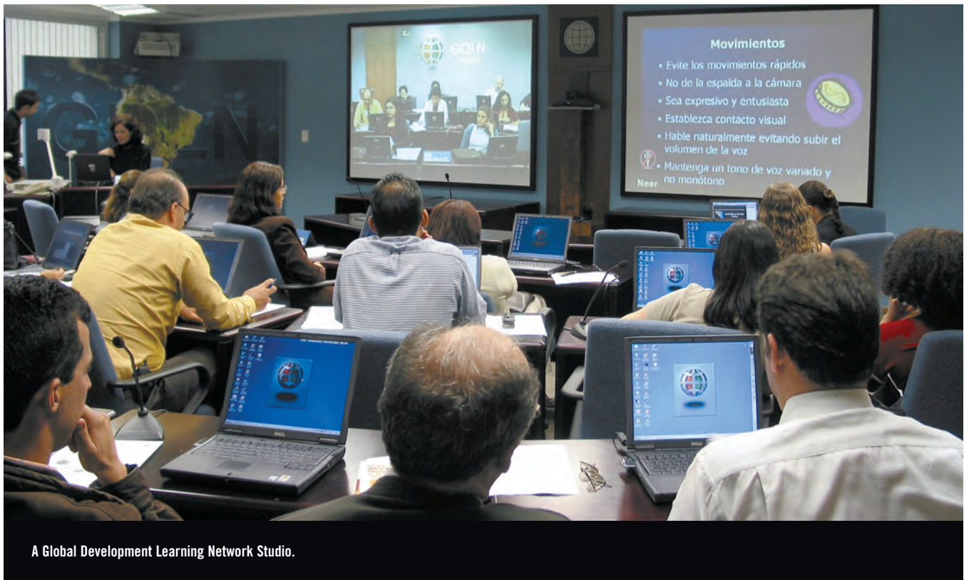
A Global Development Learning Network Studio.

But making South-South happen is also hard work. Rarely does everything turn out as planned. On top of this, ensuring that practical learning takes place can be even more difficult.