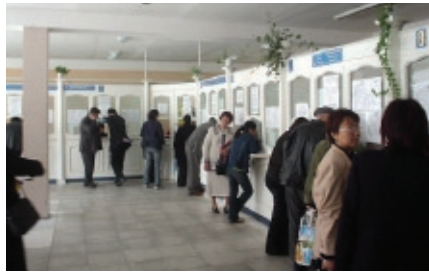
Customer service windows at the Bishkek City Gosregister Office

immovable property markets was higher. As the program shifted to rural areas, the program was coordinated with earlier government-financed programs to divide the state and collective farms inherited from the Soviet period into individual shares.