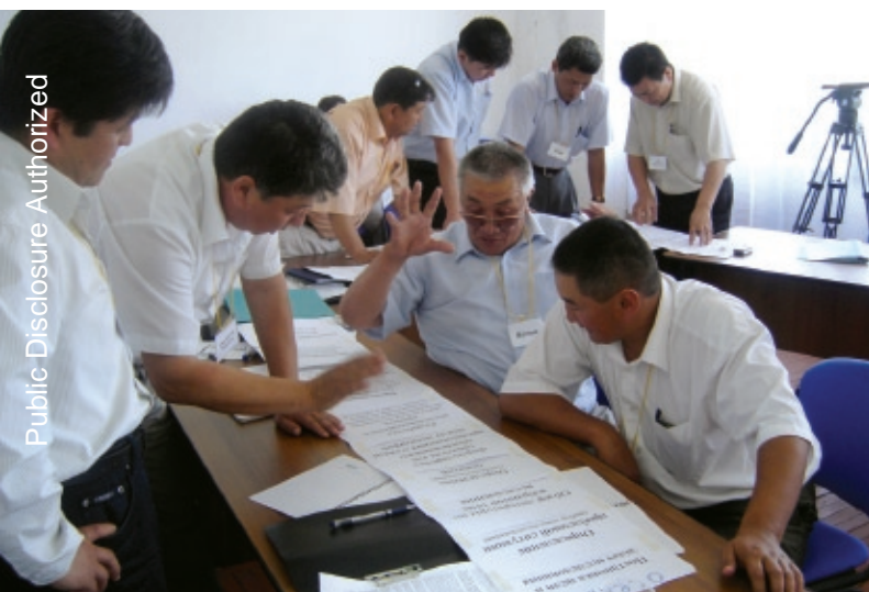
Reviewing field survey procedures in Gosregister

In 1996 the US Agency for International Development (USAID), World Bank, and other development agencies began working with Kyrgyz experts to draft the Registration Law that would be adopted in 1998. In 1999 the State Agency for Registration of Rights (Gosregister) was established, based on the examples of a number of existing institutions, including the Soviet era Bureaus of Technical Inventory and the Land Agency, which maintained information on land in urban and rural areas respectively. This solution offered two significant advantages to the property registration effort. First, the new Agency would start with staff, physical infrastructure, and direct access to existing databases on immovable property. Second, it meant that one agency was responsible for registering rights to land and maintaining the land cadastre.