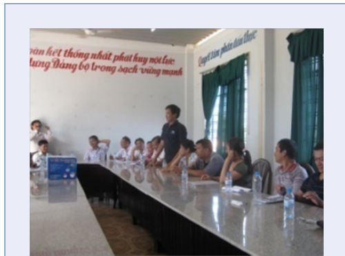
Awareness raising and capacity building account for about 15 percent of the total LWMEA Project budget.

Regional dissemination activities primarily targeted the three participating countries. But they eventually included other countries that drain into the South China Sea, thus permitting collaboration, comparison of results and experiences on waste management and policy elements, exchange and transfer of technology and approaches, and environmental awareness raising among farmers and government staff who could benefit from the knowledge and experience gained under the project. The project also provides valuable experiences beyond the East Asia region.