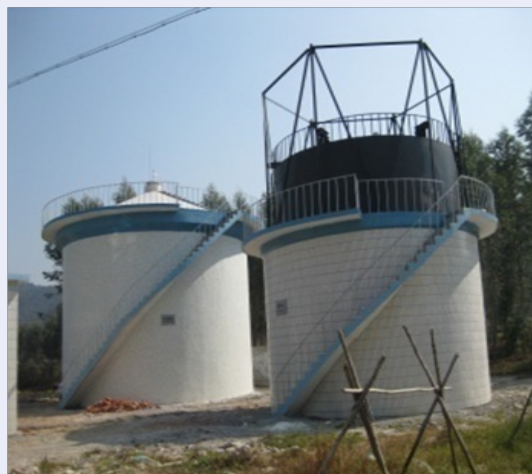
Anaerobic digesters, designed to recover and combust biogas, are recognized as the only waste management technology that can increase farm profits through use of biogas — carbon and renewable energy.