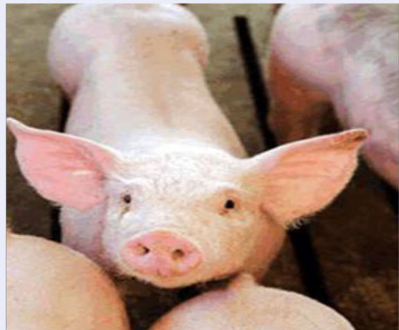
The project demonstrates pollution-control technologies to help reduce nutrient discharge from livestock production (pig farms in particular) into the South China Sea.

Under the project, finance included a 25 percent grant from GEF, a 25 percent grant from the government, and a 50 percent investment from the farm. GMI 4 (Global Methane Initiative) provided additional support — power generator, gas flare, and training — to all three countries. One significant finding of the LWMEA Project was that about 50 percent cost sharing is required to help farm owners overcome the initial cost hurdle.