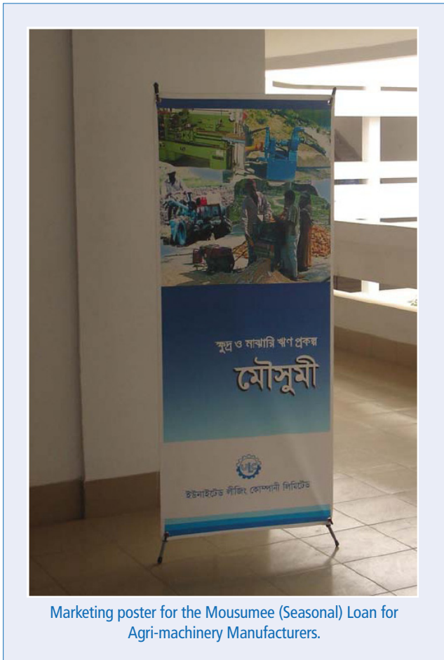
Marketing poster for the Mousumee (Seasonal) Loan for Agri-machinery Manufacturers.

The product itself, named Mousumee (meaning seasonal), is a working capital loan (maximum amount BDT 500,000, approximately US $7,350), with a tenor of 18 months due to the seasonality of the cash flow. However, given that there are companies with higher working capital needs, larger loans for longer tenor are also provided on an exception basis under the same product. This product is collateral free—in other words, no mortgage on the property is required.