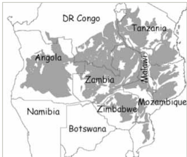
FIGURE 1.1: THE DISTRIBUTION OF MIOMBO WOODLAND

Biodiversity is significant. Although the richness and diversity of faunal species is low, the miombo region has an estimated 8,500 species of higher plants, more than 54 percent of which are endemic. Of these, 334 are trees (compared with 171 in the extensive and similar Sudanian woodlands). Zambia has perhaps the highest diversity of trees and is the center of endemism for