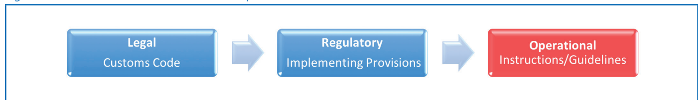
Figure 1: Albanian AEO Framework Development

Communication and outreach are vital components in the successful implementation of an initiative such as AEO. To date, efforts have been