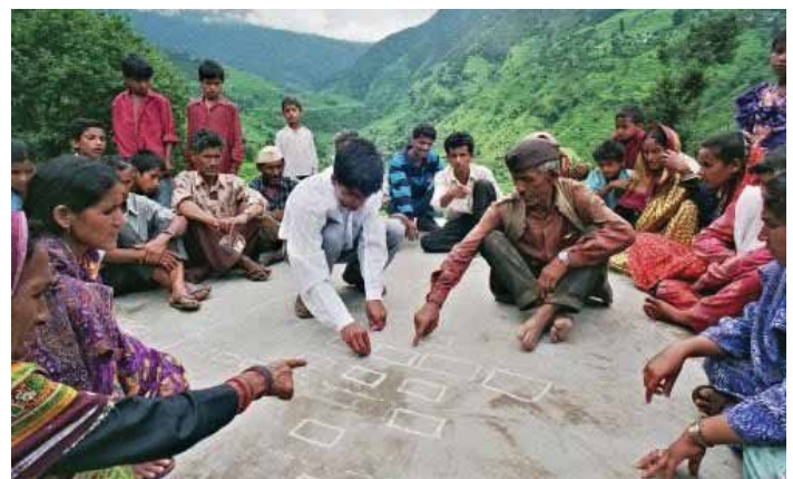
Illustration 2: CLTS in India

Local government-level trainers use hands-on methods to teach CLTS facilitation. In India and other project countries, trainers in training learn social mapping techniques (shown above), among other CLTS skills.