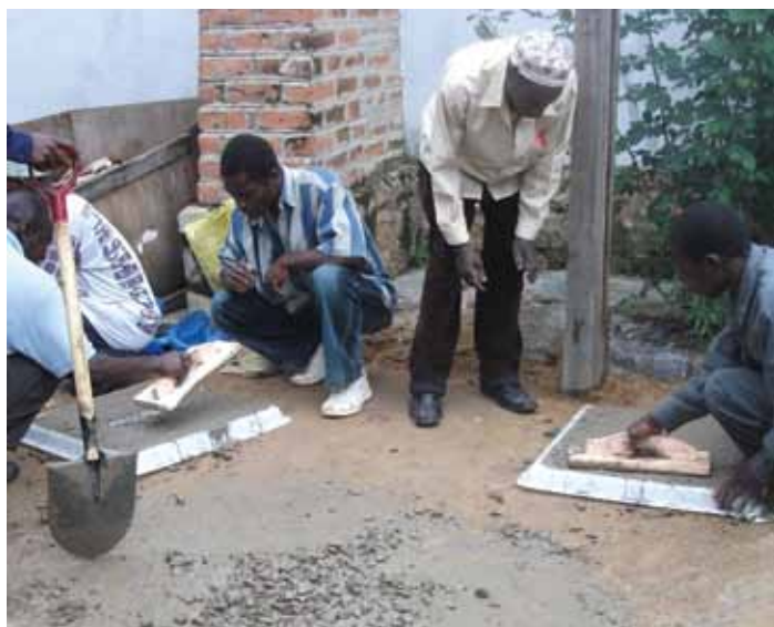
Illustration 3: Mason Training in Tanzania

Local governments provide a country-wide human resource base for scaling rural sanitation. By training local masons to build quality sanitation products (e.g., sanplats), governments provide quality assurance and boost sustainability.