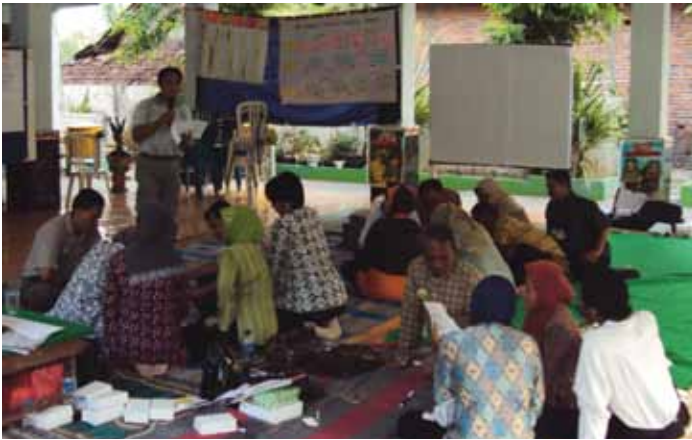
Illustration 1: Local Language Resources in Indonesia

In Indonesia, Bahasa is the most commonly spoken language, but there are many local dialects as well. Creating effective training materials that are easily translatable within or between countries is a common challenge for scaling up projects.