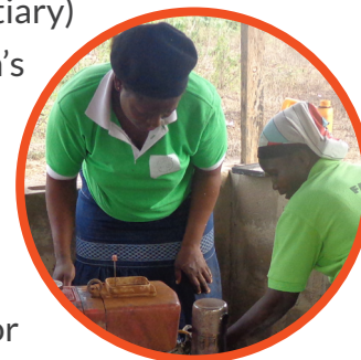
Female agro-processors grinding cassava with Fadama equipment

Different factors explain why better-endowed women tend to be selected for executive positions. Among other things, their financial and writing skills sends a positive signal on their capacity to adequately manage the groups' budget and administrative requirements. In addition, economic