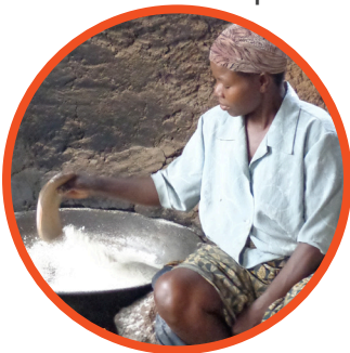
A woman frying cassava

First, men and women in the area we studied are economically interdependent in the cassava and palm oil value chains. In fact, while men engage mainly in crop planting and harvesting, women do most of the agro-processing, including processing their husbands' and male relatives' crops (e.g. processing of cassava into garri or processing of palm nuts into palm oil).