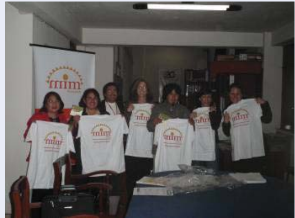
MIM volunteers in Ancash.