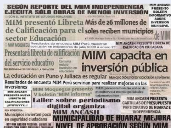
Figure 5: Sample Headlines Publishing MIM Information