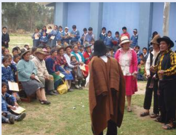
MIM volunteers perform "Don Justo" street theatre in a rural community of Ancash.

activities (including face-to-face meetings with communities and local leaders), and capacity-building activities. The MIM technical teams—each composed of two to three young professionals who receive support from the executing agency—had a hard time reaching the high targets set for them. That's why they started recruiting volunteers.