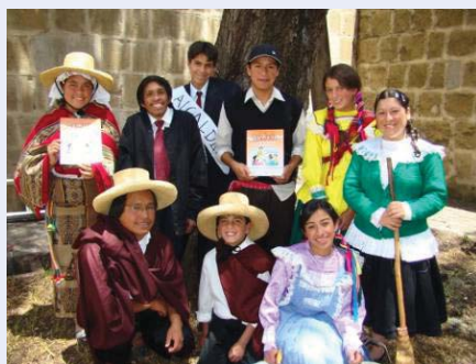
MIM volunteers in Cajamarca are ready for a street theater performance to teach rural communities about royalties and municipal investment.