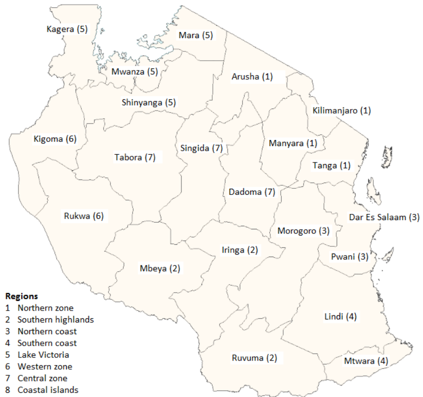
Figure A1: Agro-climatic regions of Tanzania