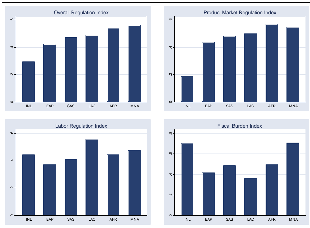
Figure 1: Regulation around the World

Note: AFR: Africa region, EAP: East Asia and Pacific region, INL: OECD, LAC: Latin America and the Caribbean region, MNA: Middle East and North Africa region, SAS: South Asia region