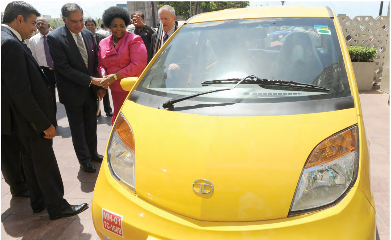
South African International Relations Minister, Maite Nkoana-Mashabane, inspects the world's cheapest car, the Tata Nano, during a 2010 visit to India aimed at boosting trade ties.

Developing countries today hold more than US$5 trillion in foreign exchange reserves, which is nearly double the amount held by affluent countries. 2 In 2007, no fewer than 85 developing countries recorded per capita income growth faster than the OECD average of 2.75 percent. 3 India and China have sus-