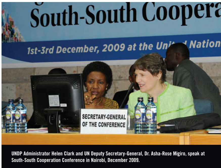
UNDP Administrator Helen Clark and UN Deputy Secretary-General, Dr. Asha-Rose Migiro, speak at South-South Cooperation Conference in Nairobi, December 2009.

In spite of the great strides made by developing countries as a group, it is important to recognize the remarkable diversity that prevails between indi-