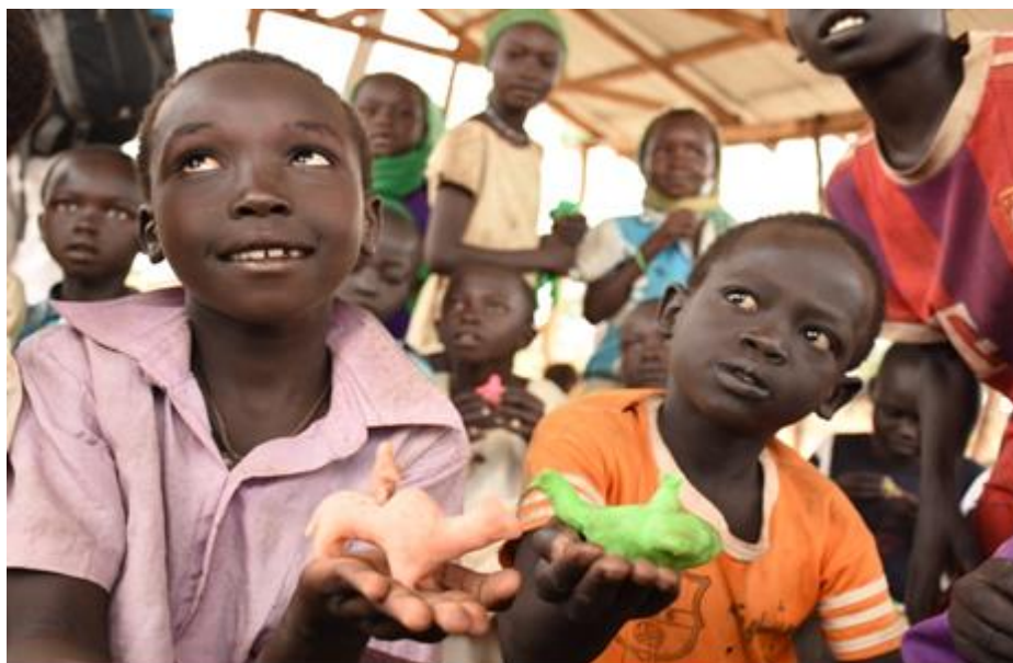
Photo credit: ECD Center in Maban refugee camp, Upper Nile State @ UNICEF/Margaret Manoah/2012