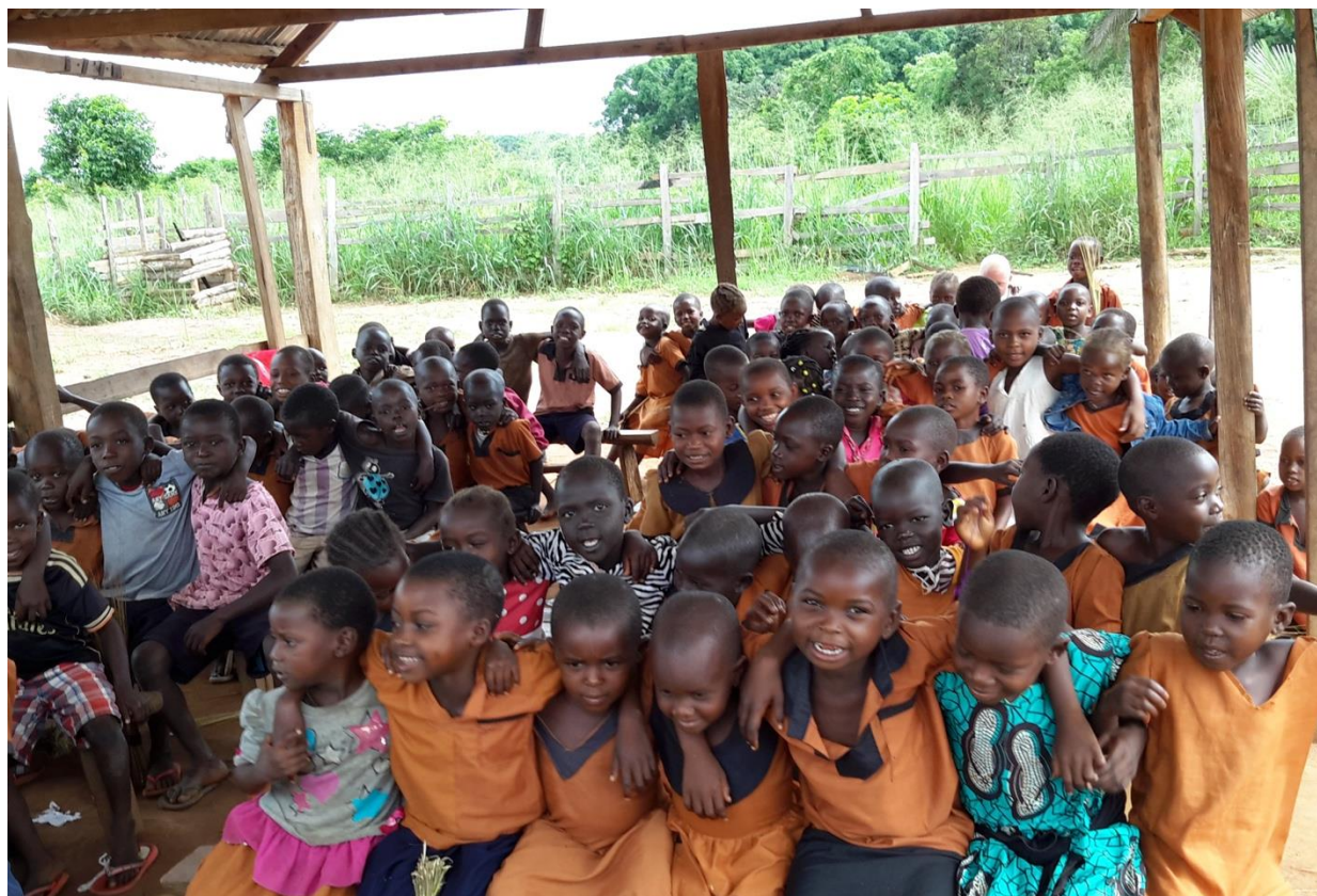
Zereda Nursery School in Nzara, Western Equatoria

children in South Sudan with access to pre-primary education as set out in the Constitution and 2012 Education Act would require significant expansion of the provision of classrooms, teachers and resources which would in turn require the commitment of significant financial resources. As well while there is growing interest in the role of ECD/ECE programs in promoting peacebuilding 28 not much is known about effective ways of providing ECD/ECE services in the context of conflict and fragility.