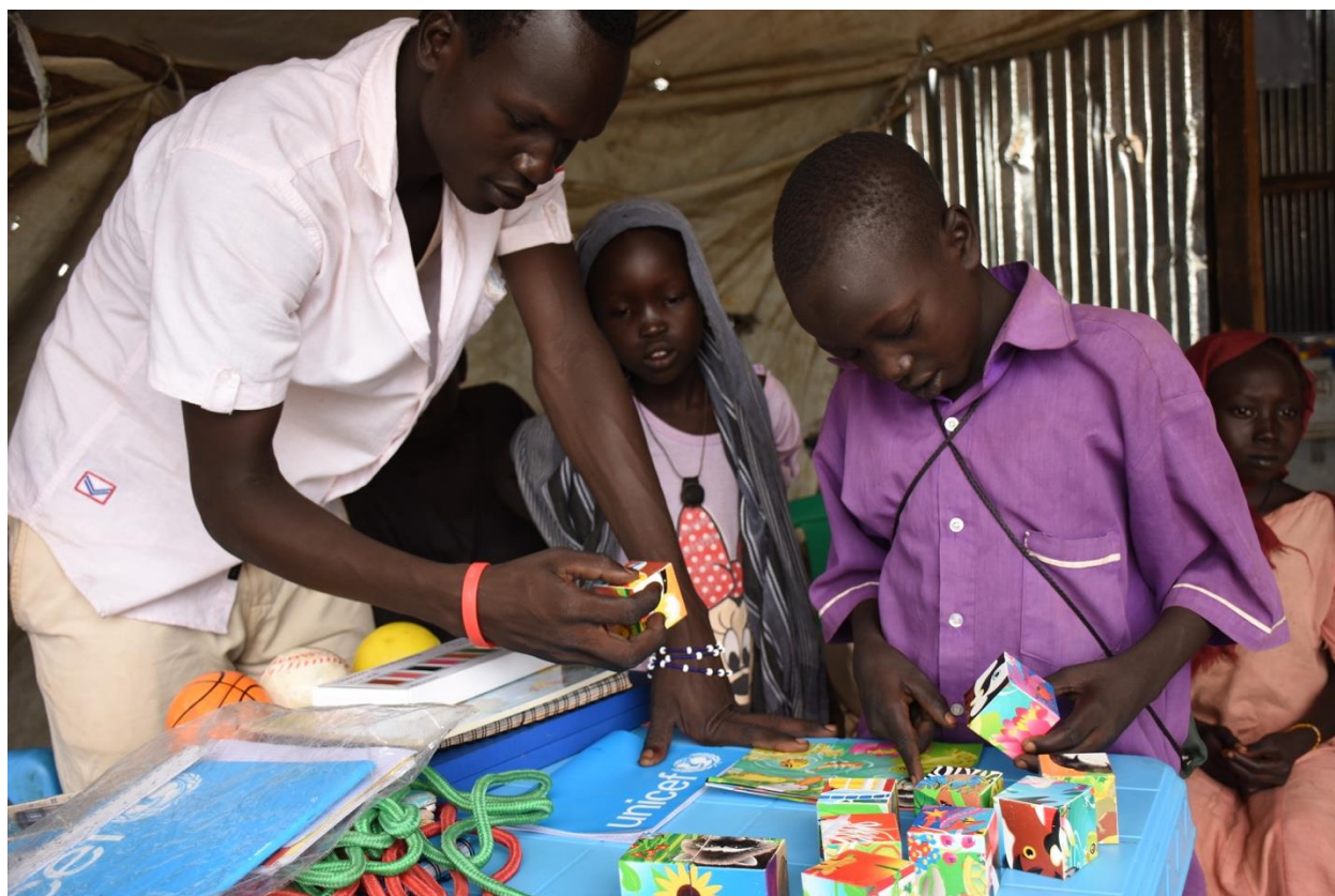
ECD center in Maban refugee camp, Upper Nile State.

Despite the many challenges that it faces in meeting a range of human development needs, the government has acknowledged the importance of pre-primary education by explicitly including it in the General Education Strategy. With the support of GPE and UNICEF, relevant policies and curricular documents have been developed and there are personnel in the MOGEI who focus specifically on pre-primary education.