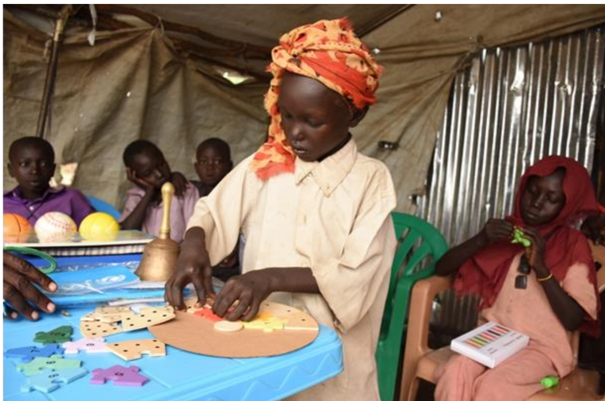
ECD Center in Maban refugee camp, Upper Nile State