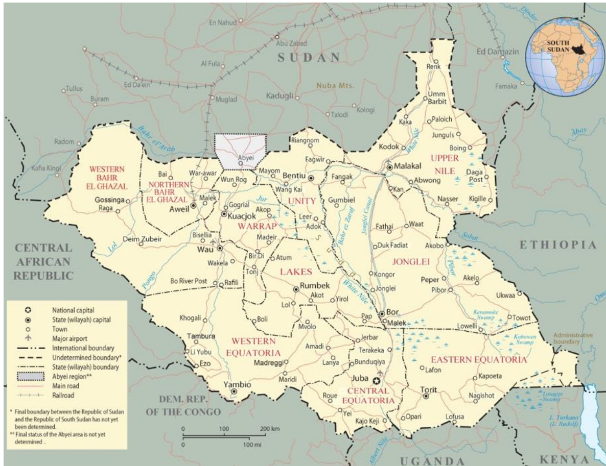
Figure 1: Map of South Sudan 22

According to the Global Partnership for Education (GPE), the education system in South Sudan is characterized as a low investment, low capacity, but high demand system. The 2012 General Education Act (9(1) a-c) sets out three levels of formal education: Pre-primary, Primary and Secondary. It defines pre-primary as “spanning two years and serving as an introduction to the schooling experience for children in the ages of 3-5” and not ages 3-6. 23 Educational resources are distributed very inequitably between and within states (e.g. there are notable differences between classrooms, teachers and textbooks at the primary level in regions across the country). This inequity can be explained by issues of insecurity, localized returnee/IDP populations, administrative and financial gaps. The strain on limited existing resources is further exacerbated by the influx of returnees and internally displaced persons (IDPs) as a result of ongoing conflicts and floods within the country. Most states have a poor gender parity index (GPI) of 0.4 - 0.5 in primary school enrollment (the rare exception being Juba county with a GPI of 0.9). Similar gender disparities exist for teachers at all levels: typically, only 5 to 7.5% of teachers are female (with Juba county’s 32.3% female teachers as the exception). Children with special needs make up about 2.3% of the school population (baseline data for the entire population are unavailable),