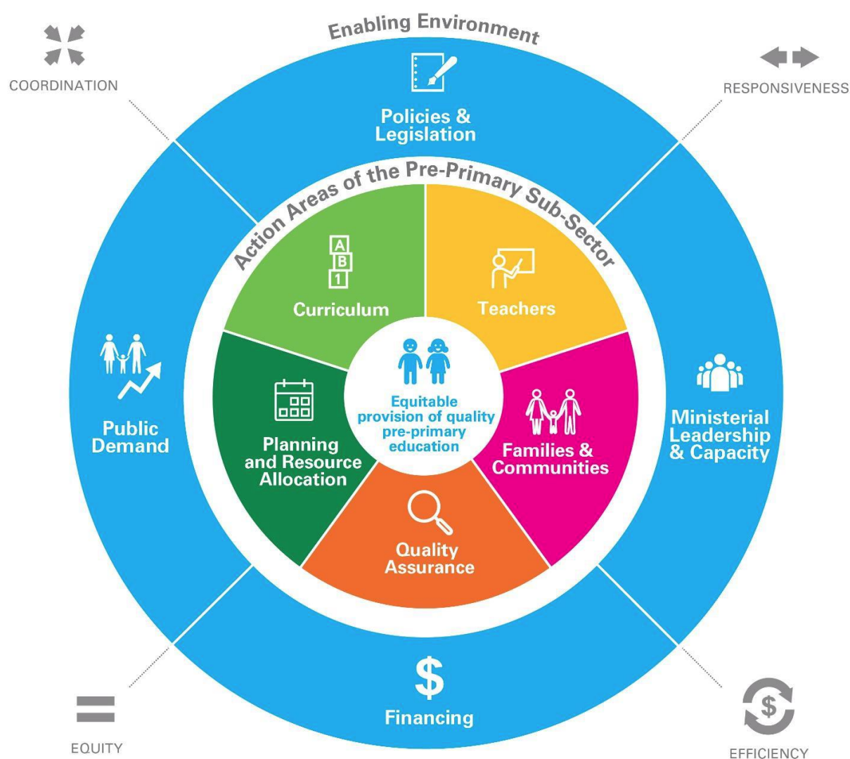
Figure 4. Pre-primary conceptual framework

During the workshop, participants were introduced to the Pre-Primary Conceptual Framework developed by UNICEF. The framework provides a basis to understanding the pre-primary system at all levels (local, sub-national, and national) that must be addressed in order to deliver quality pre-primary opportunities to all children. The framework's objectives are: (i) to provide a systematic approach in planning and supporting pre-primary education that is influenced through a systems perspective; (ii) to help identify elements of an enabling environment and action areas for an effective subsector; (iii) to establish a shared vision; and (iv) to set a solid foundation for a strengthened pre-primary subsector.