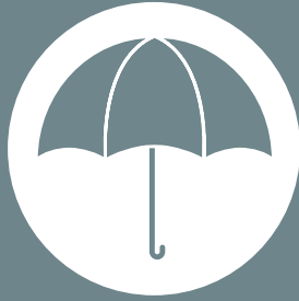
UNIVERSAL HEALTH COVERAGE (UHC)

Universal health coverage (UHC) is the goal that all people and communities can use the promotive, preventive, curative, rehabilitative, and palliative health services they need, of sufficient quality to be effective, while also ensuring that the use of these services does not expose the user to financial hardship (WHO 2010). UHC has two pillars: coverage with essential, quality health services and financial protection. UHC embodies the commitment to giving priority to the worse off—the sickest, those with the lowest coverage, and the poor—and to health as a human right. Under SDG3, Target 3.8, countries have committed to achieve UHC, “including financial risk protection, access to quality, essential health-care services and access to safe, effective, quality and affordable essential medicines and vaccines for all.”