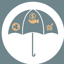
HIGH-PERFORMANCE HEALTH FINANCING (HPHF) FOR UHC

Health financing is a core component of health systems, concerned with the mobilization, pooling, and allocation of financial resources, including the purchasing of products and services. Good health-financing systems are a necessary, though not sufficient, condition for progress toward UHC.