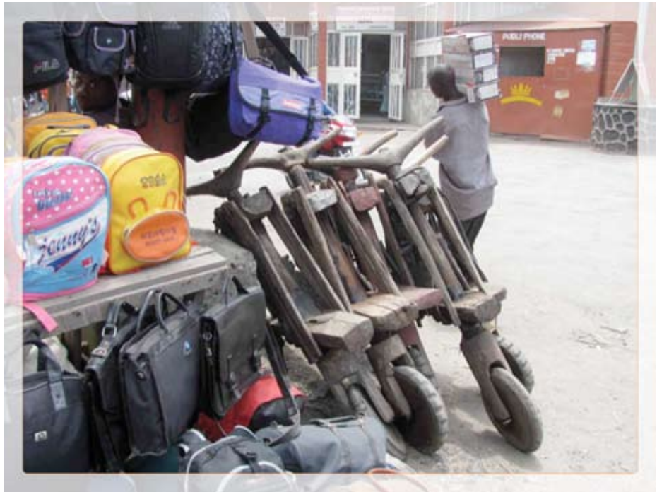
Makenga’s small business and chukudus

The village of Kibumba in North Kivu is close to the border with Rwanda and is located on the slopes of the volcanic Mt Nyiragongo. However, Kibumba has perennial water scarcity due to the difficulty in drilling boreholes through the multiple layers of lava that have formed as a result of frequent eruptions. Some