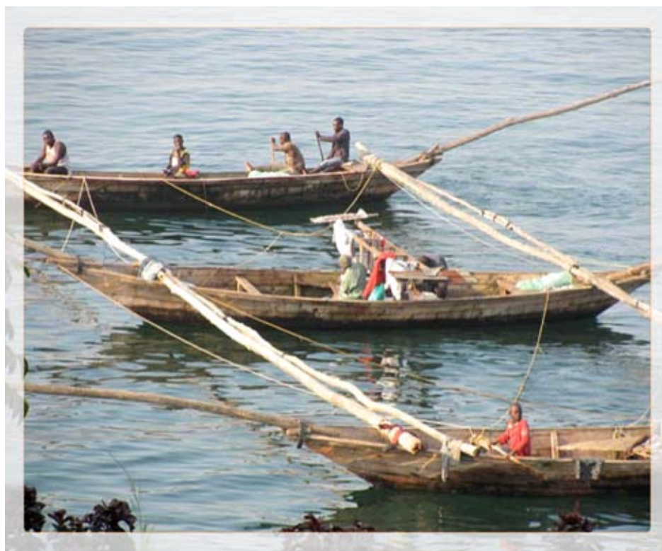
Kawaida Fishing Group on Lake Kivu, North Kivu

“This is a skill that we acquired during the