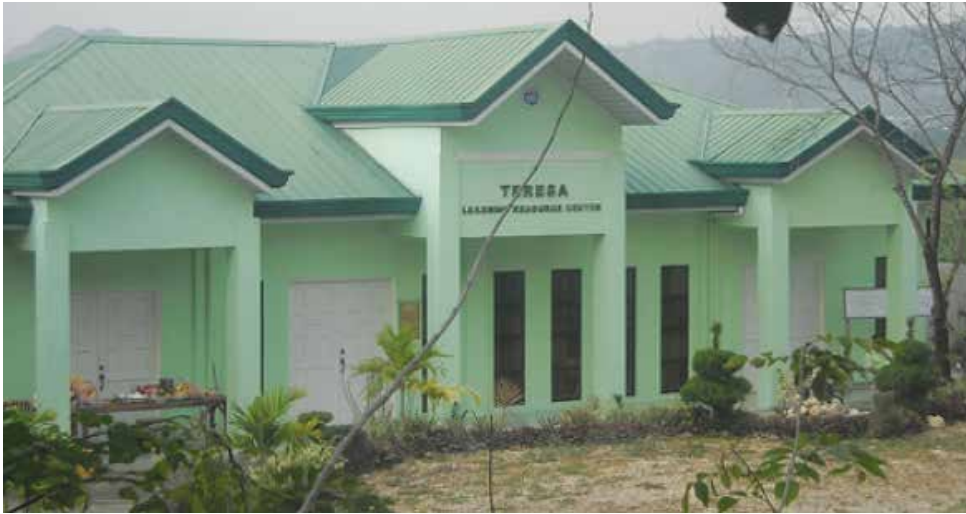
The Integrated Solid Waste Management Facility in Teresa, Philippines operates a Learning Resource Center where waste management training is offered to local government units and interested parties for a fee.

worthwhile if the expenditures for composting are less than how waste would otherwise be disposed.