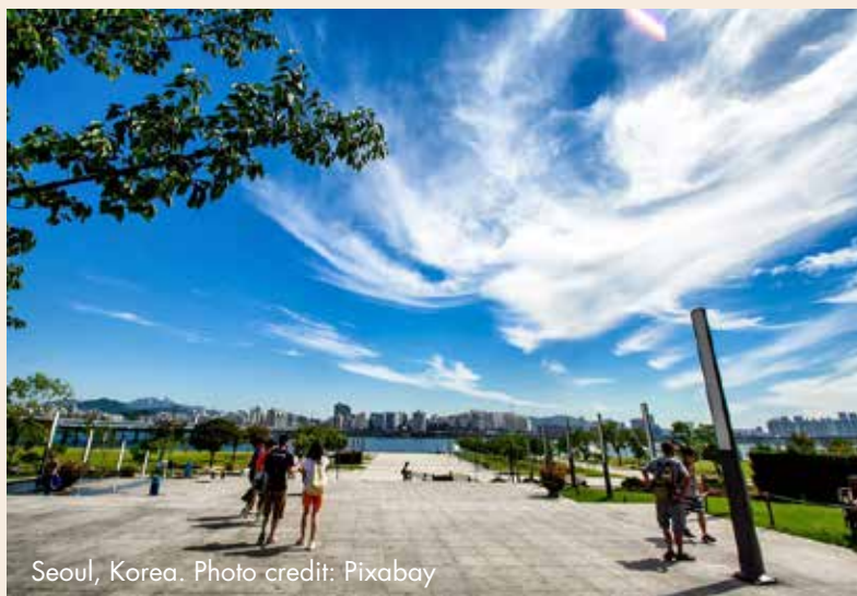
Seoul, Korea.