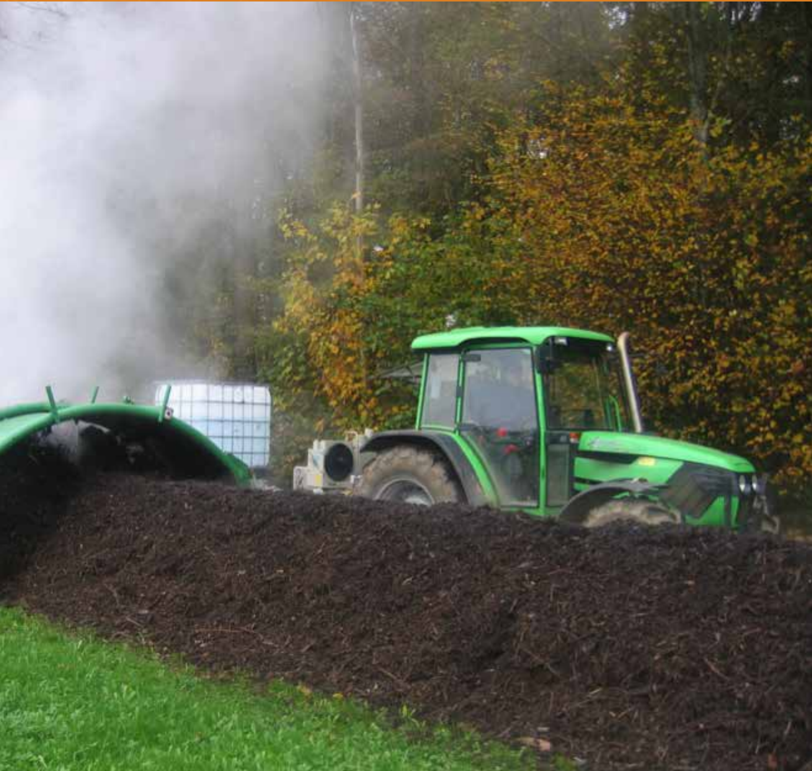
Steam rises as warm, maturing compost is turned.