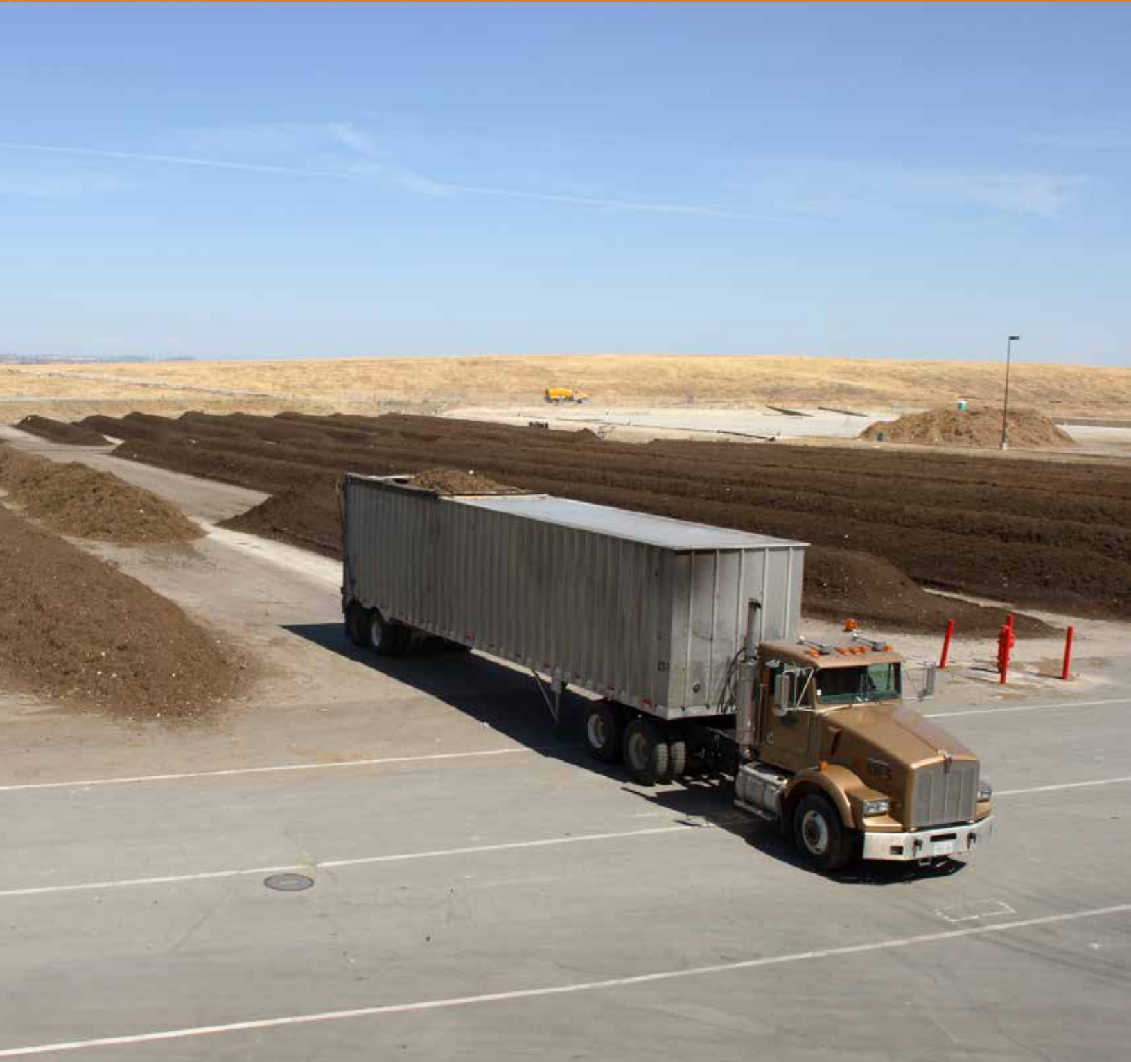
Rows of compost maturing in the sun.