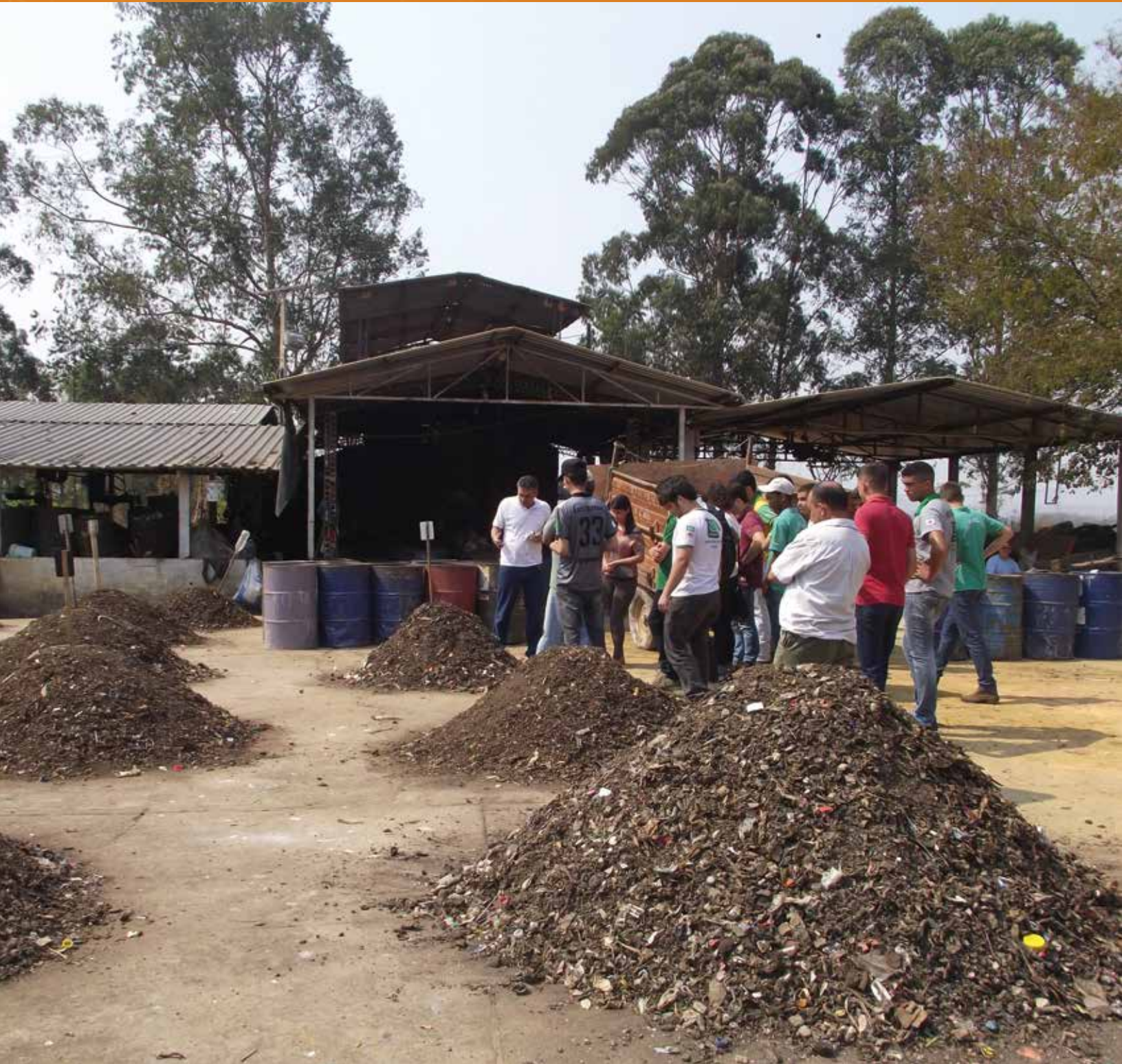
Students visit a screening and composting plant in Brazil.