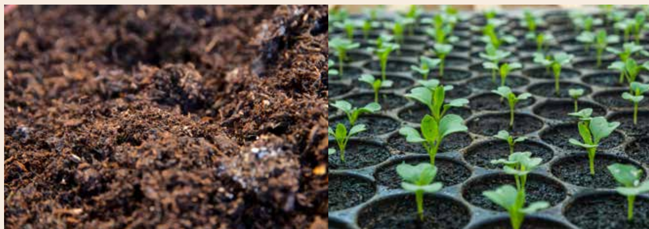
Finished compost (left). Seedlings are grown for city's reforestation program using compost outputs (right).

The final compost product is sold at a low price to farmers (~$8/ton), of which transportation costs are a large component. Today, 100% of the compost produced is sold.