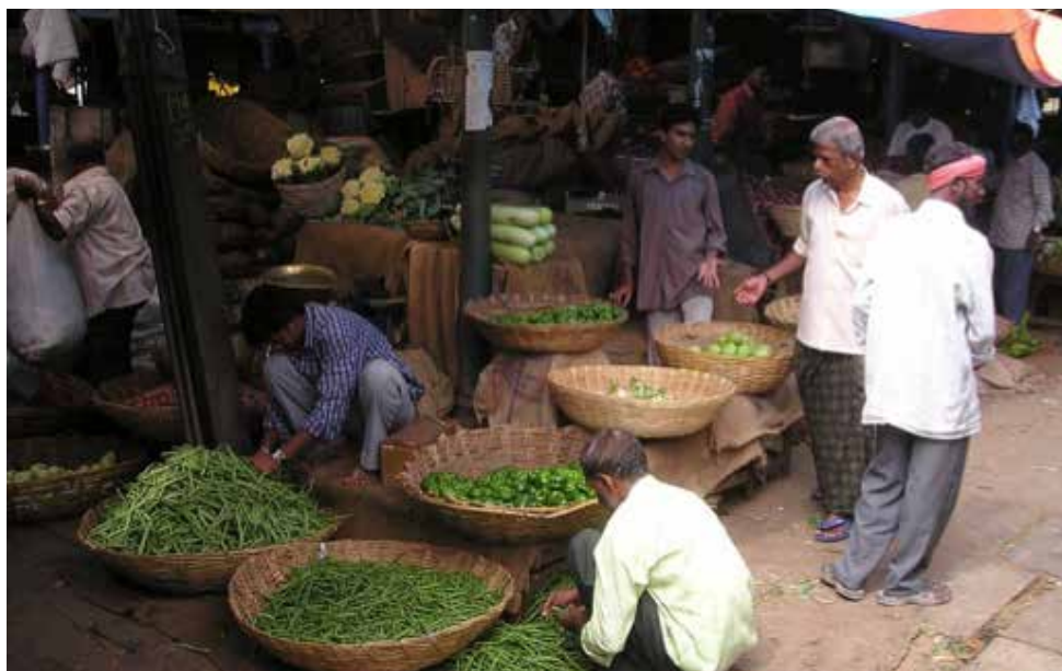
A vegetable market in India.