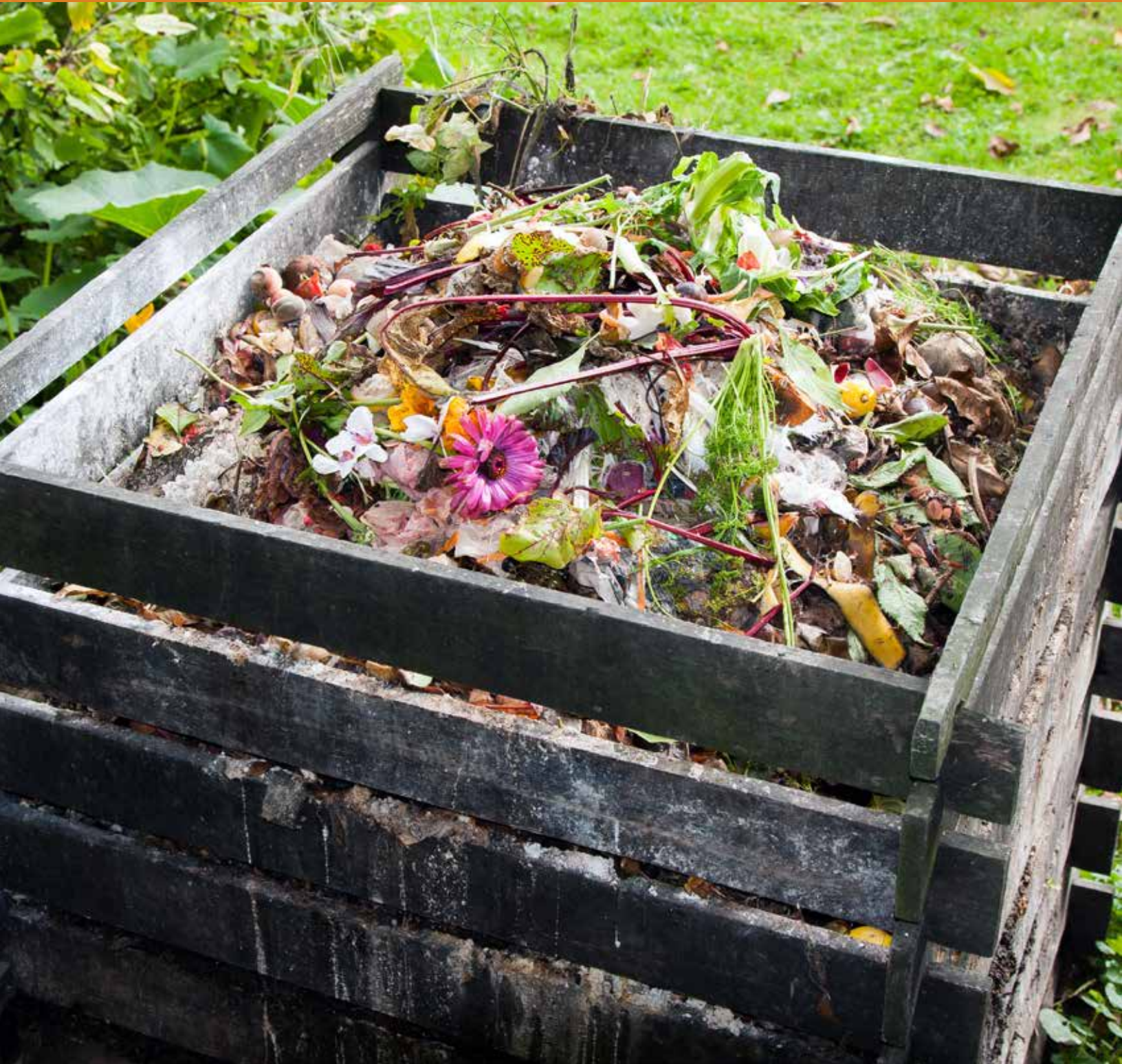
Composting bin.