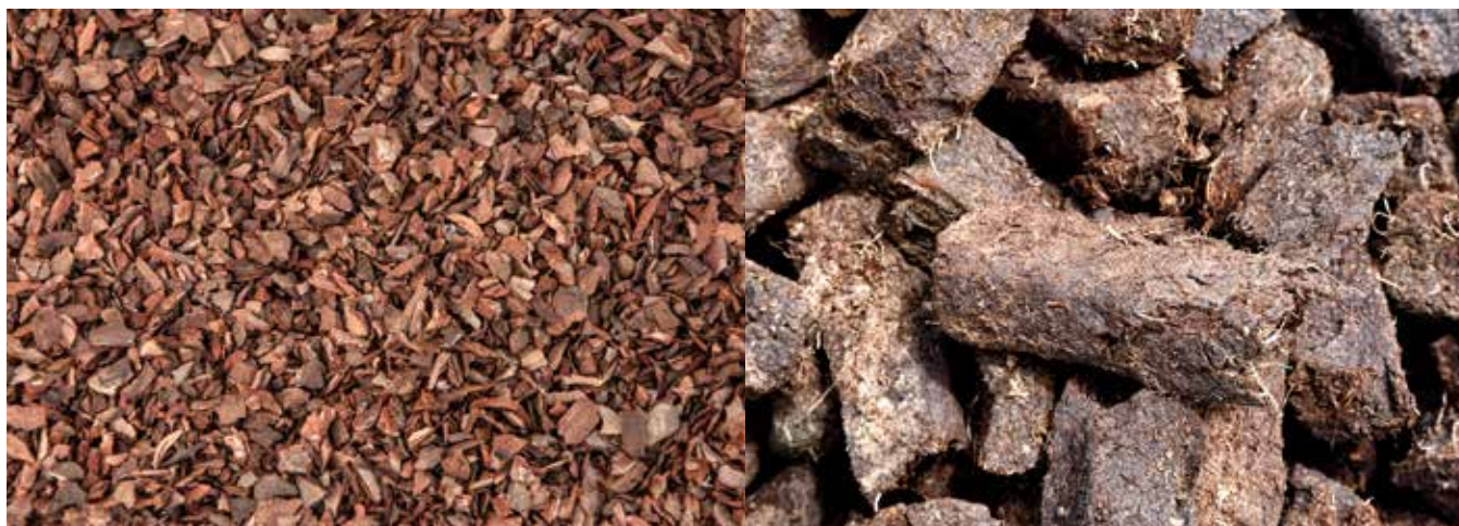
Bark mulch (left) and blocks of dried peat (right).

Despite the differences in soil additives, an integrated plan nutrient management system is becoming increasingly common, and the use of multiple products in combination have proven to be more effective than a single product alone (Chen, 2006). Compost and fertilizers can complement each other: numerous studies have shown that when compost is applied together with fertilizers, plant nutrient uptake is far higher than when fertilizers are applied alone, leading to improved yields (Abedi, Alemzadeh, Kazemeni, 2010; Sikora and Azad 1993). When biofertilizers, or microorganisms that increase nutrient availability to plant roots, are added as well, nutrient uptake can be increased further (Chen, 2006). The co-beneficial effects of an integrated approach can result in financial savings for farmers by reducing the overall need for additives. It also significantly reduces nutrient runoffs and algae blooms, which sustains land quality and protects surrounding waters. In fact, the usage of compost is aligned with the needs of the agricultural community.