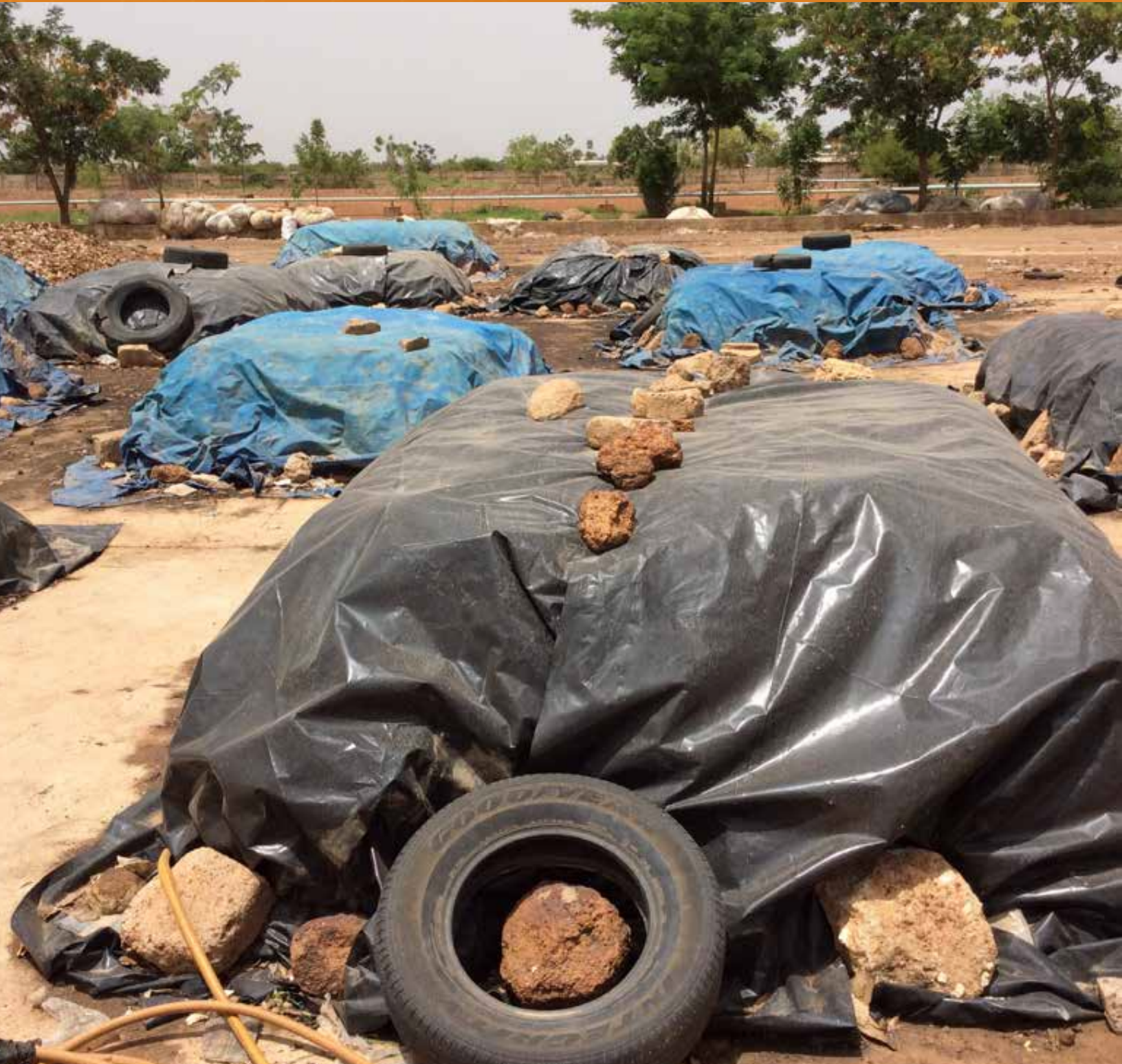
Covered windrows at a commercial composting facility in Ougadougou, Burkina Faso.