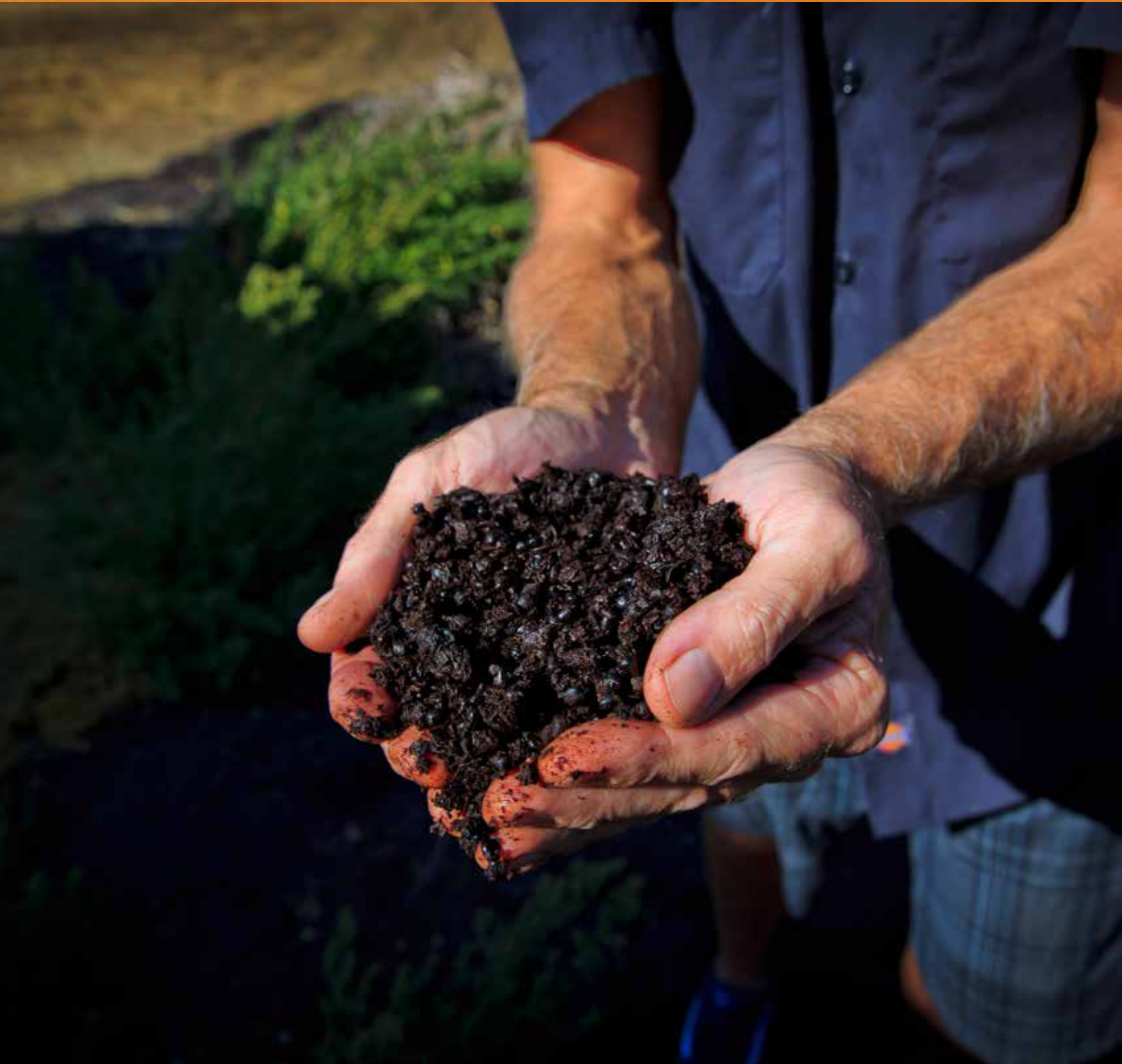
Fresh compost in a farmer's hands.