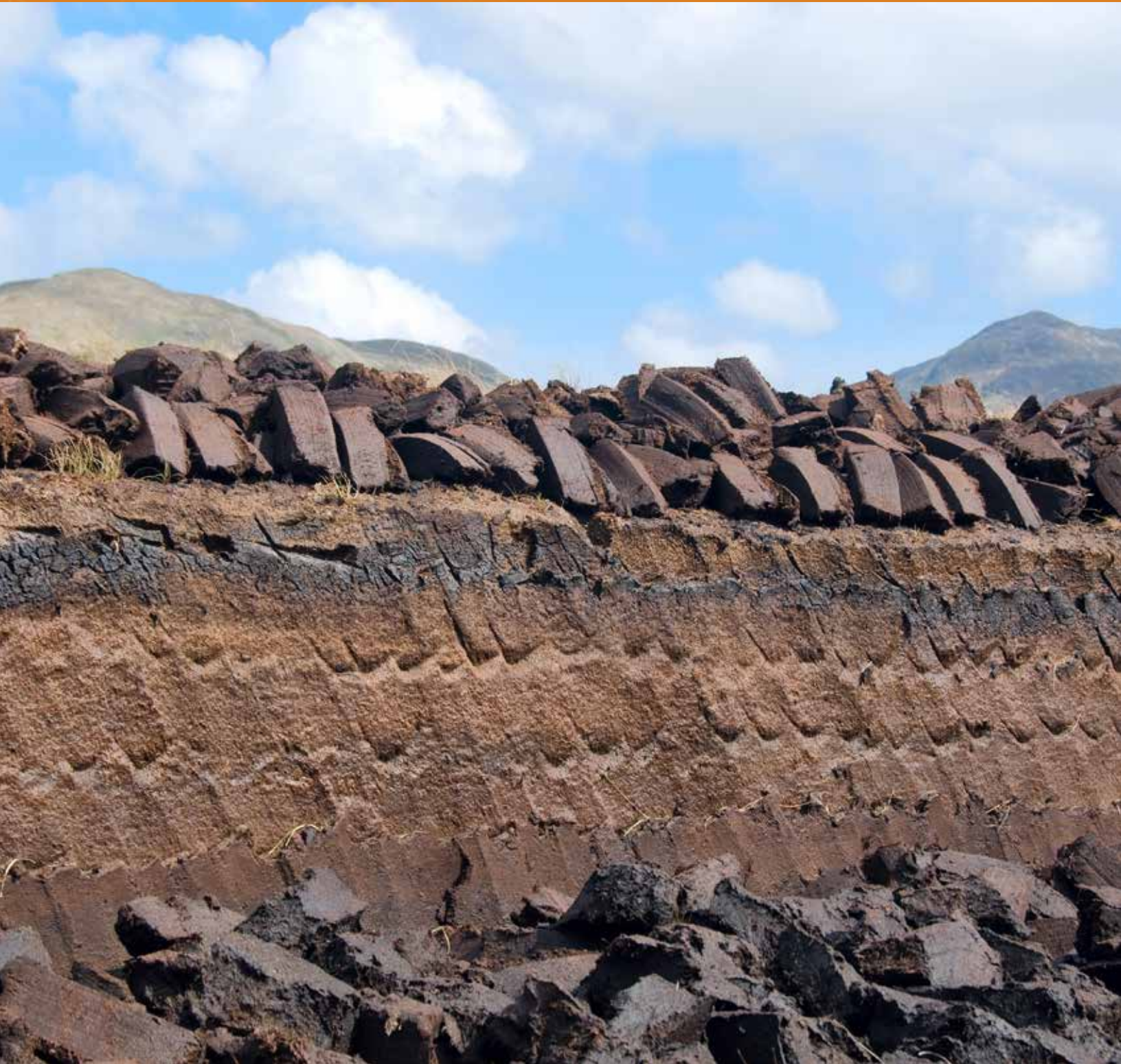
Peat mining.