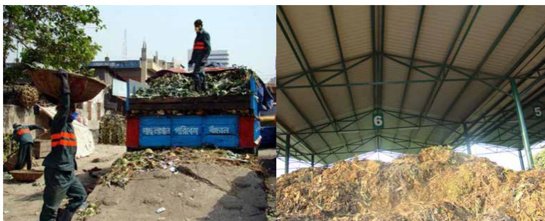
Organic waste collected from vegetable markets and other sources (left). Matured compost pile in the shed at Waste Concern's Bulta facility (right).

Waste Concern partnered with Dutch recycling company, WWR, in 2005 to develop a large scale composting facility in Dhaka. Through a joint venture called WWR BioFertilizer Ltd. Bangladesh, the company successfully registered the first composting project through the Clean Development Mechanism of the United Nations Framework Convention on Climate Change in 2008. The composting project initially had a planned capacity of 700 MTPD, spread across three processing sites. However, due to the collapse of the carbon market in 2012, only a single site was constructed in 2009. This facility located in Bulta, Narayangaj (greater Dhaka) has an installed capacity of 130 MTPD and is currently operating at 60% capacity due a lack of carbon revenues and current negotiations with the DCC around the supply of organic feedstock. To date, the facility has processed a total of 102,183 MT of waste from food markets and produces between 2,200 and 3000 MTPY of compost (Waste Concern, 2016).