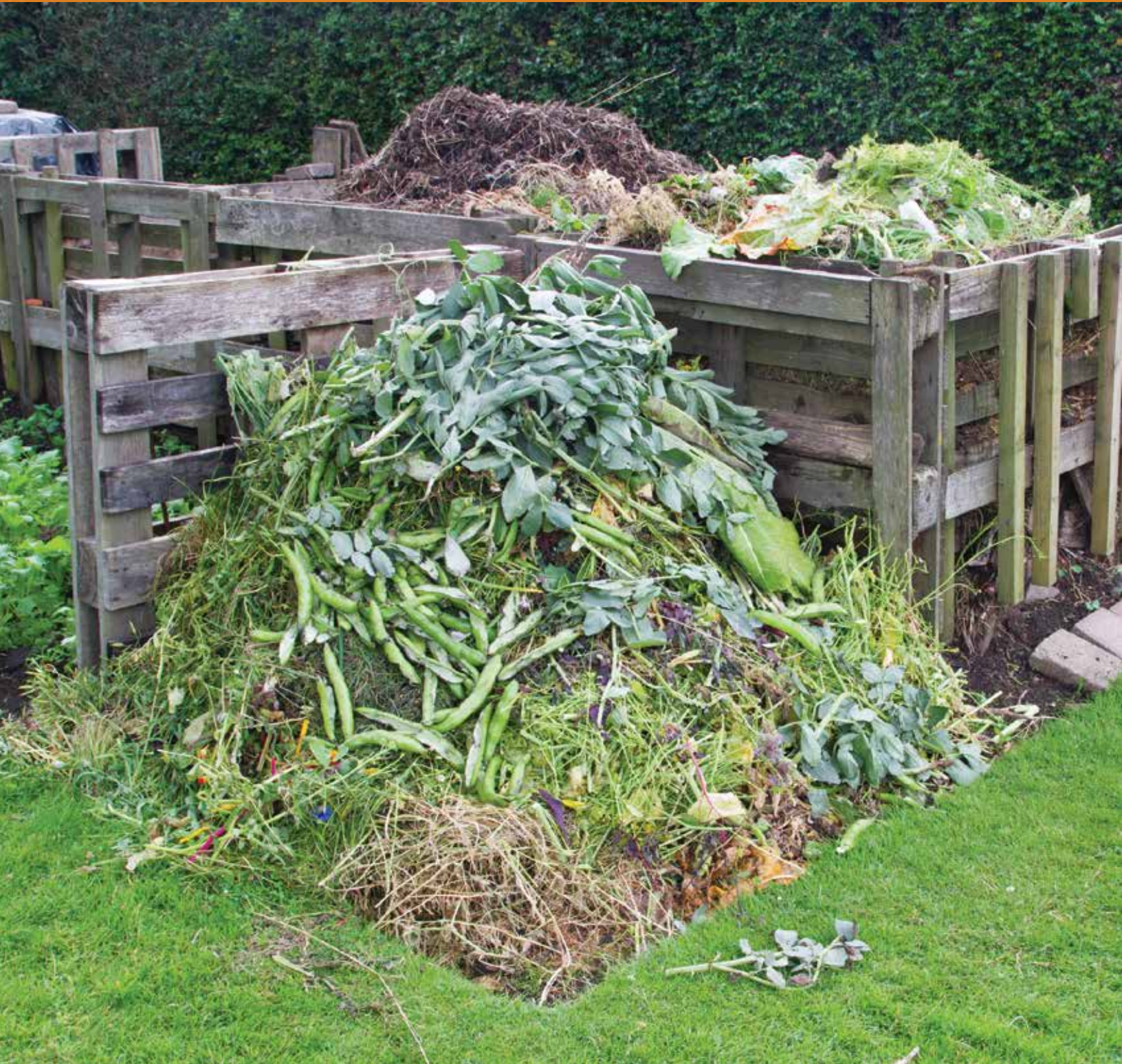
Small-scale community compost bins at a local farm.