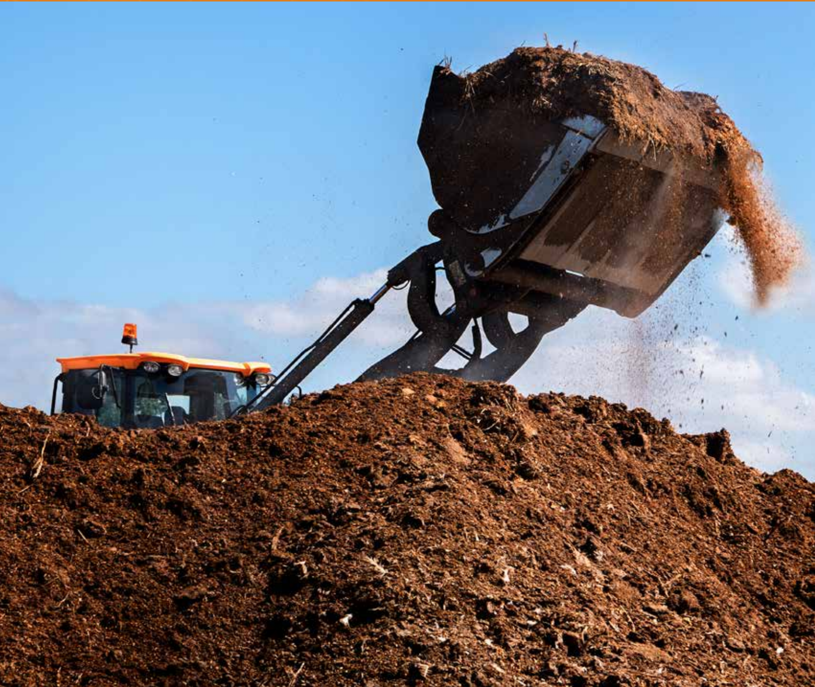
Excavator shovel working on a large heap of organic fertilizer.