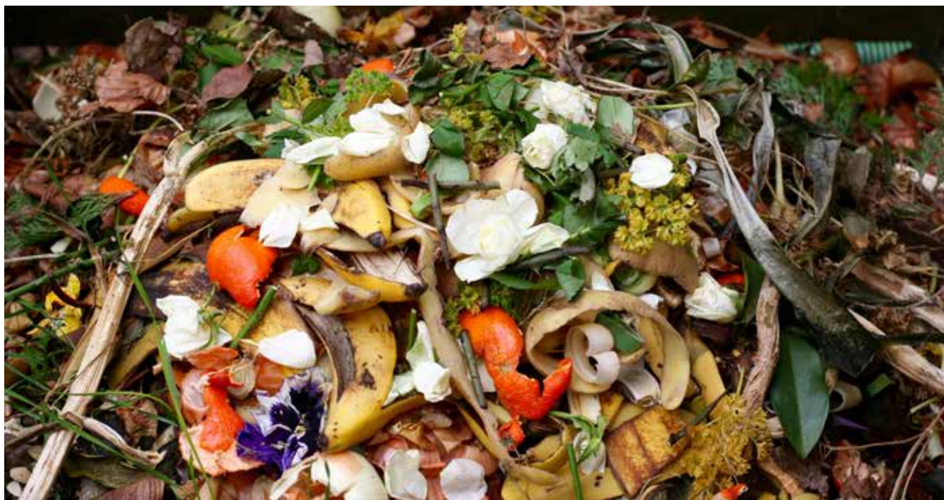
Fruit and vegetable waste in a compost heap.

contamination of water streams, and restrained land use (e.g., park spaces that contain glass). The most efficient and cost-effective way to reduce contamination is at the source: by ensuring that the inputs are as pure as possible upon receipt, which limits intermediate separation steps needed to remove contaminants. There are a few common sources of feedstock for composting, including market waste, institutional food waste, commercial food waste, agricultural feedstock, landscaping waste, and municipal solid waste.