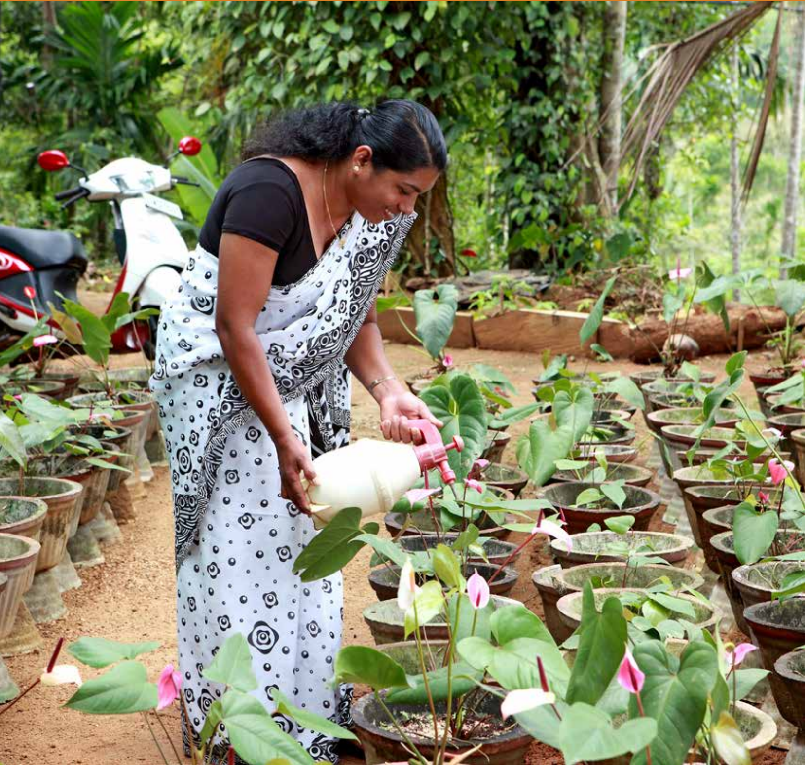
Woman tending plants in Sri Lanka.