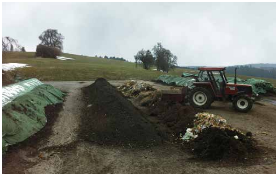
Fresh organic waste is added to windrows at an Austrian farm composting facility.