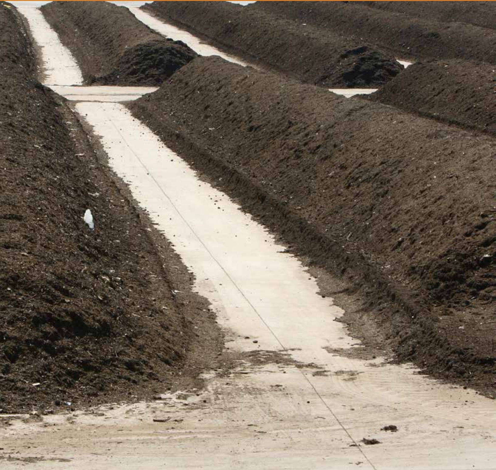
Rows of mulch at a green waste recycling plant.