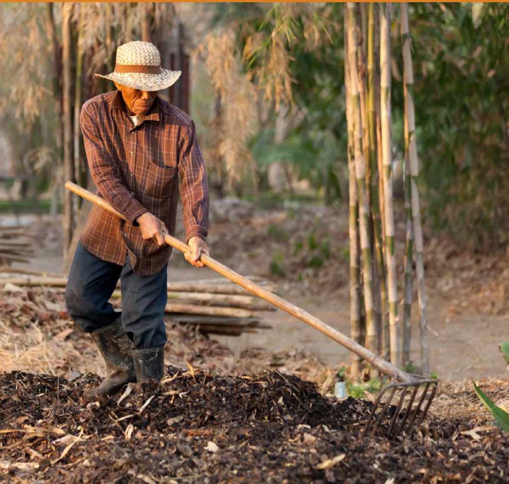
Farmer raking soil and dry leaves to produce nutrient-balanced organic compost in Thailand.