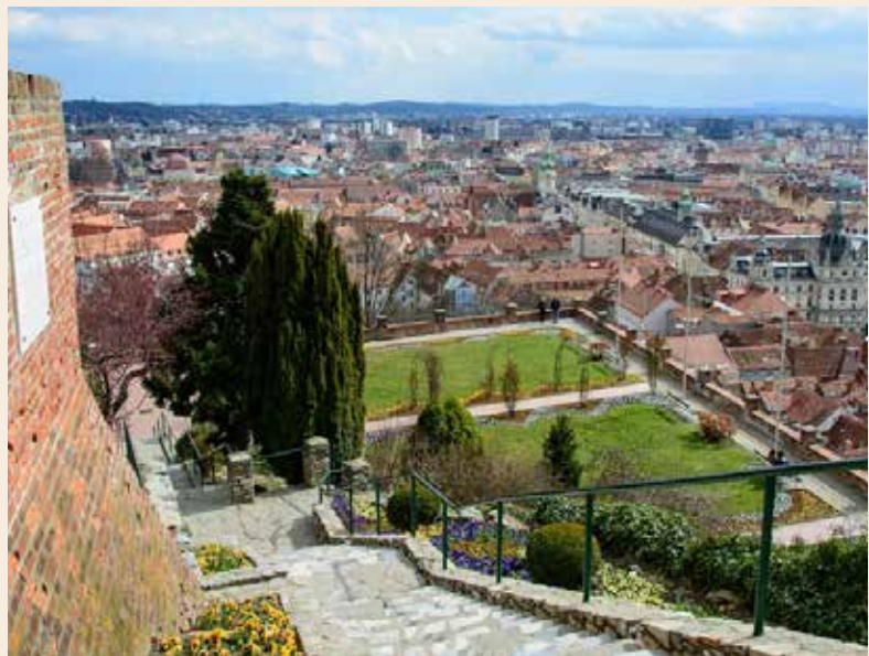
Aerial view of Graz, Austria.