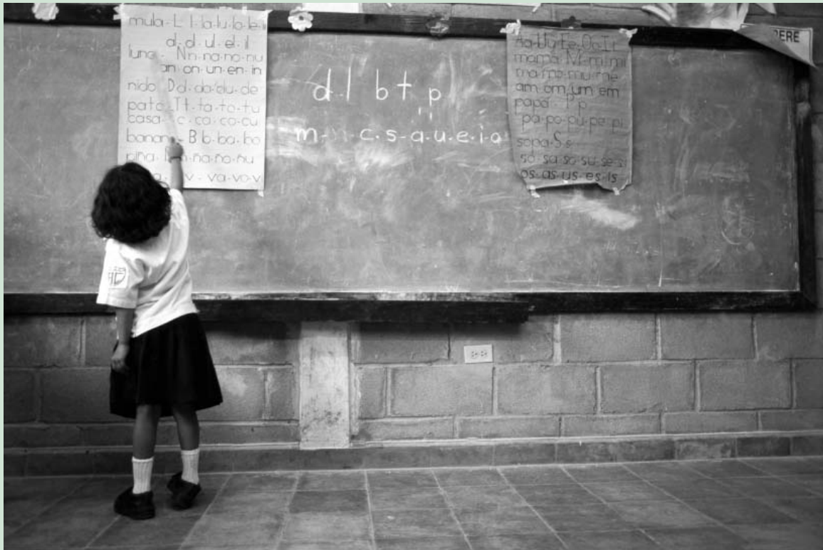
Student at the public primary school in Tegucigalpa, Honduras.