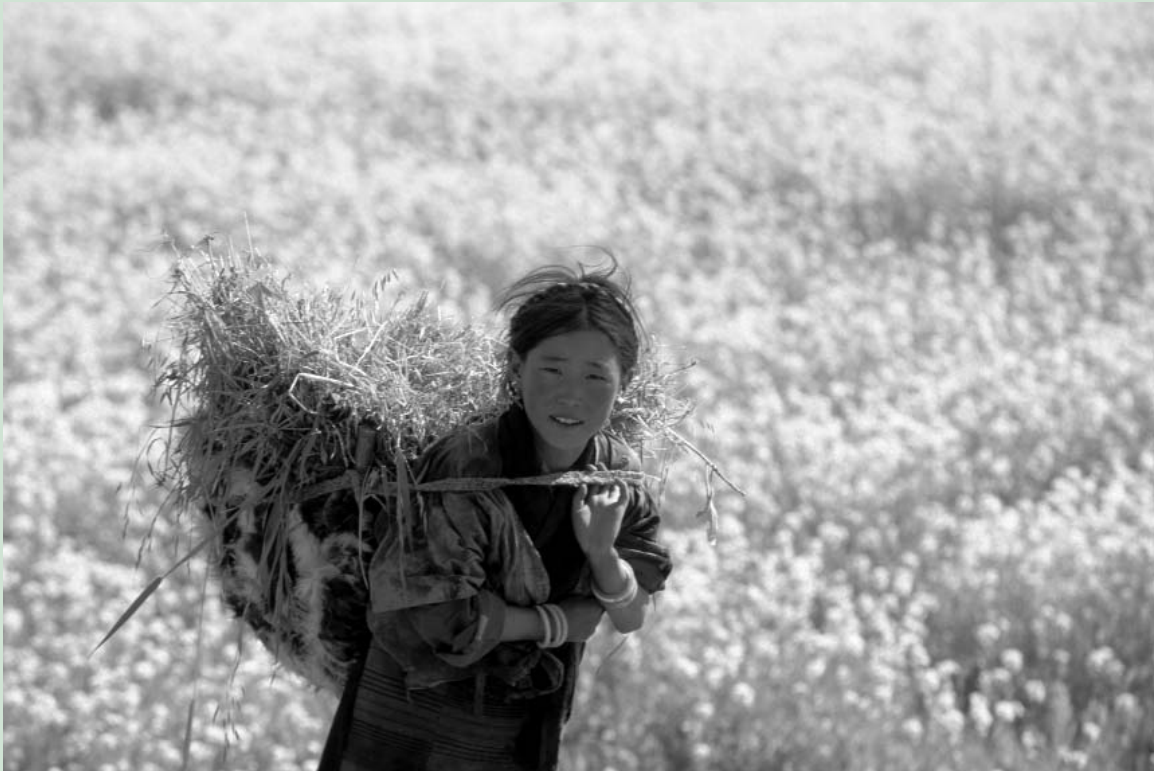
Woman in China carrying a crop in her basket.