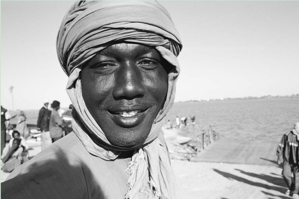
Money changer on bank of Senegal River.