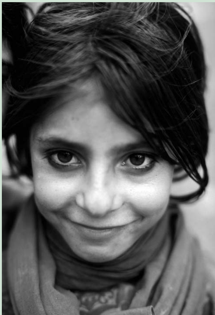
Indian girl.