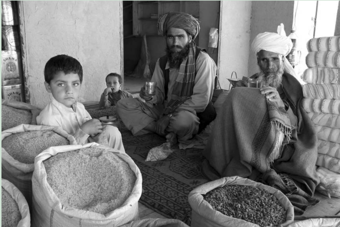
Three generations at a family-owned store in Kabul, Afghanistan.