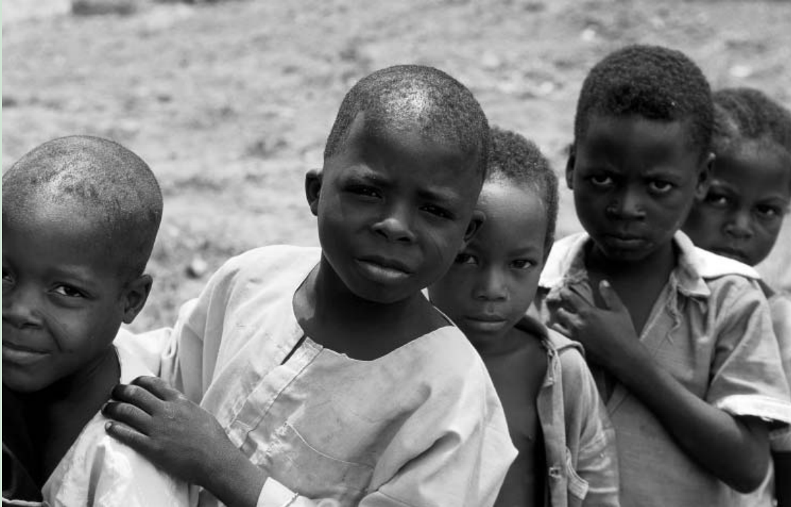
Boys in Nigeria.