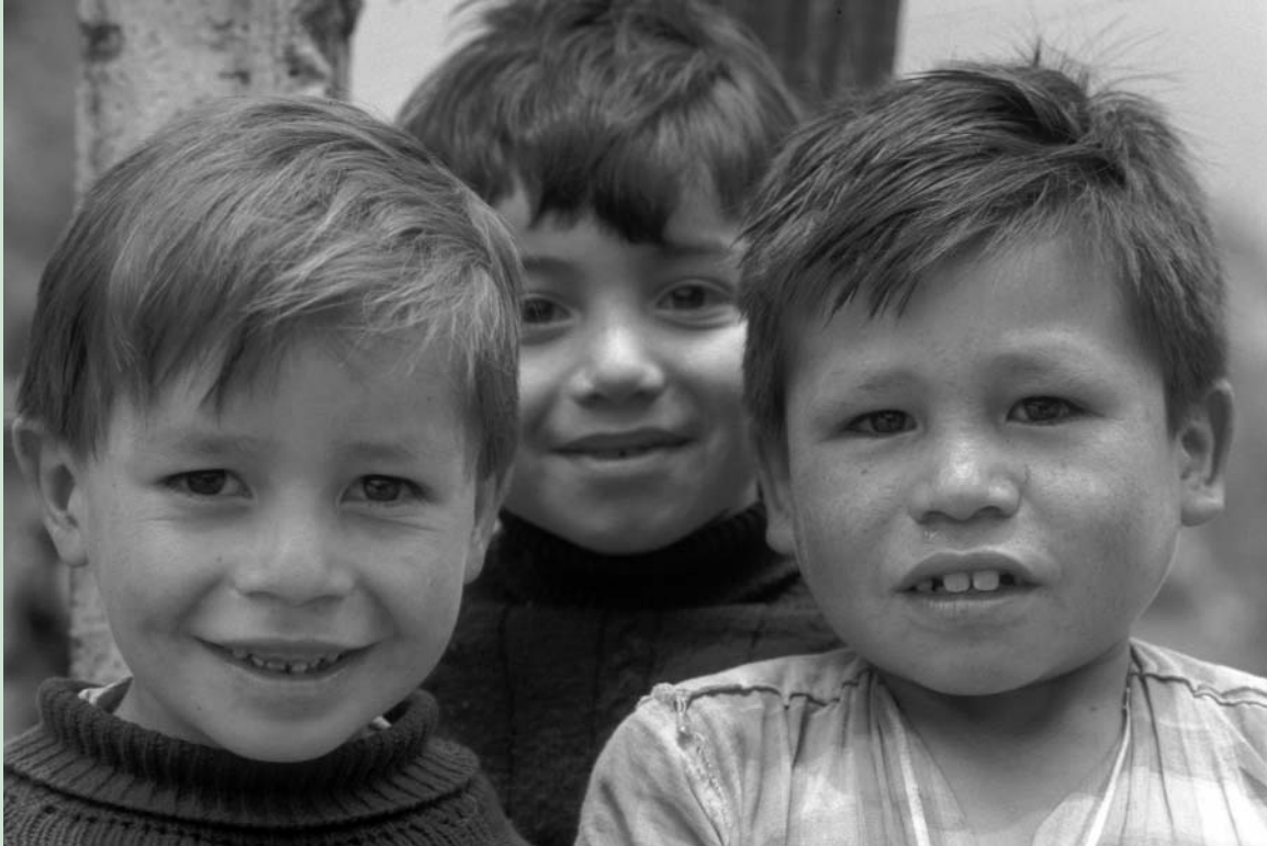
Colombian children.