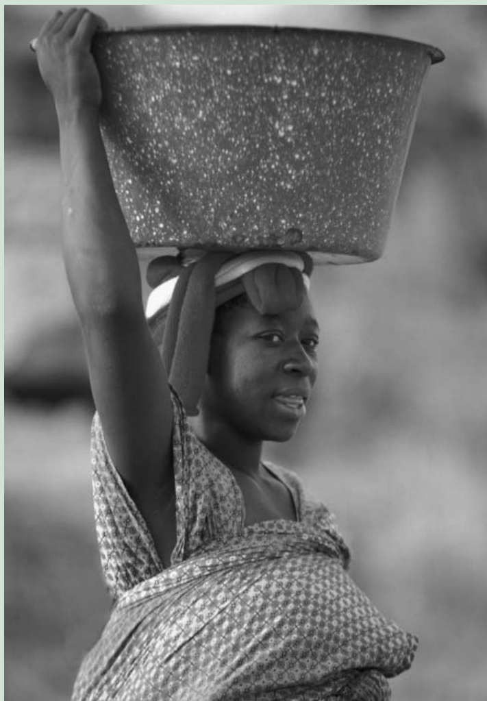
Woman from Mali.