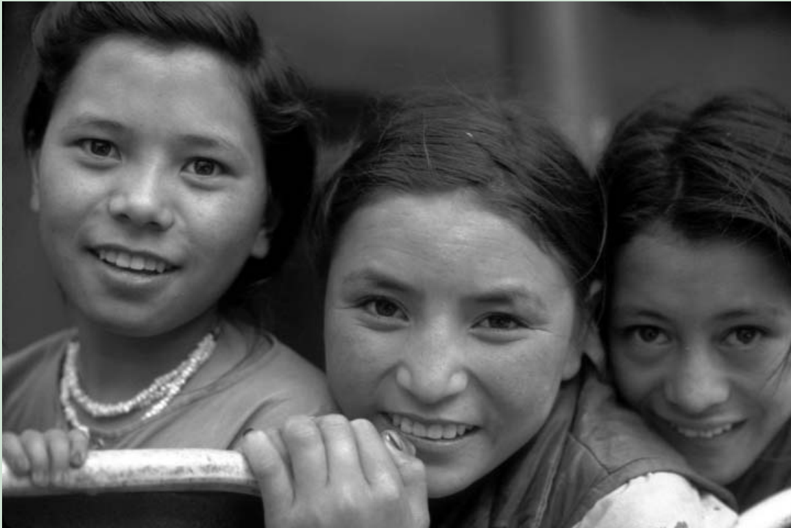
Three Indian women.