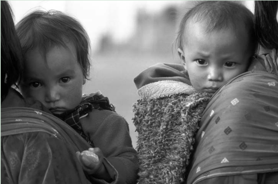
Children with their mothers in Bhutan.