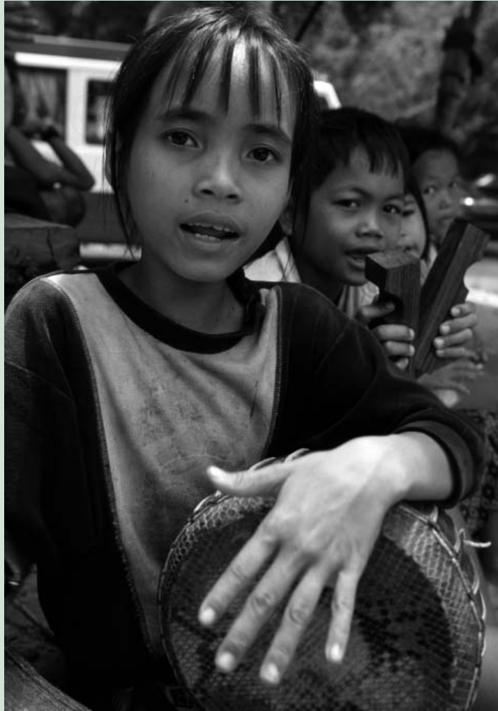
Villagers playing traditional Cambodian music for tourists in Angkor Wat.