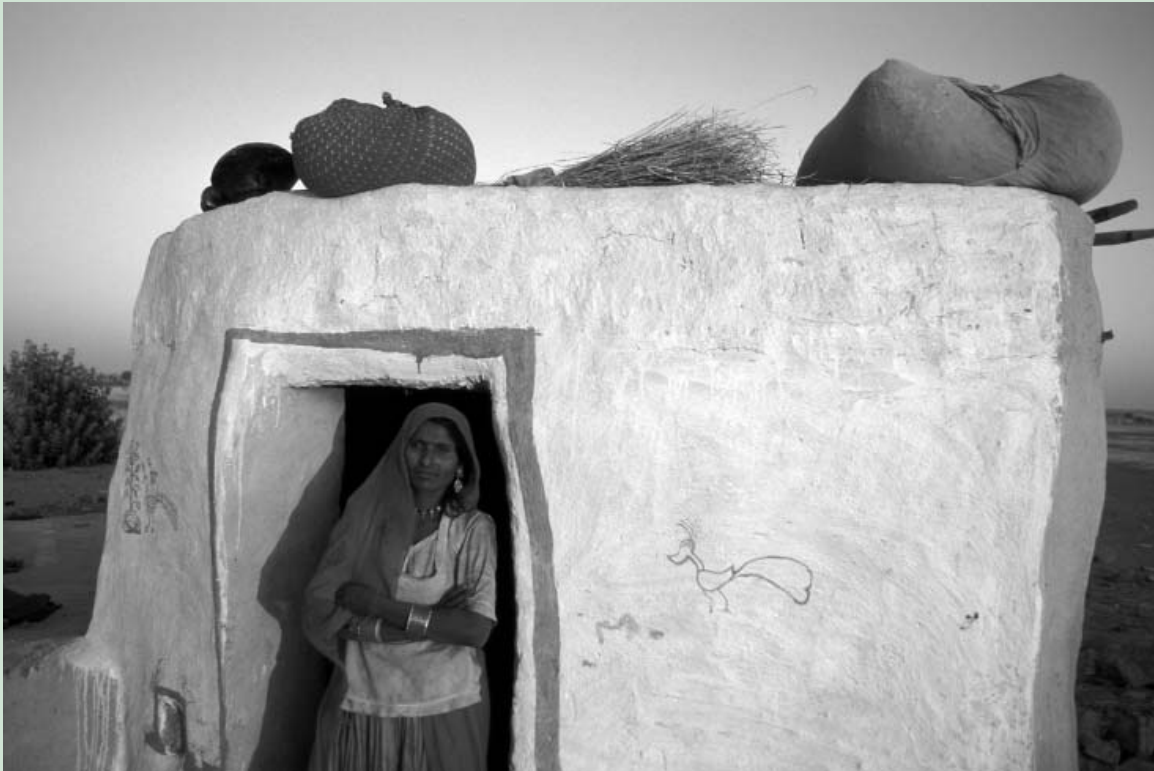
Indian woman standing in doorway.