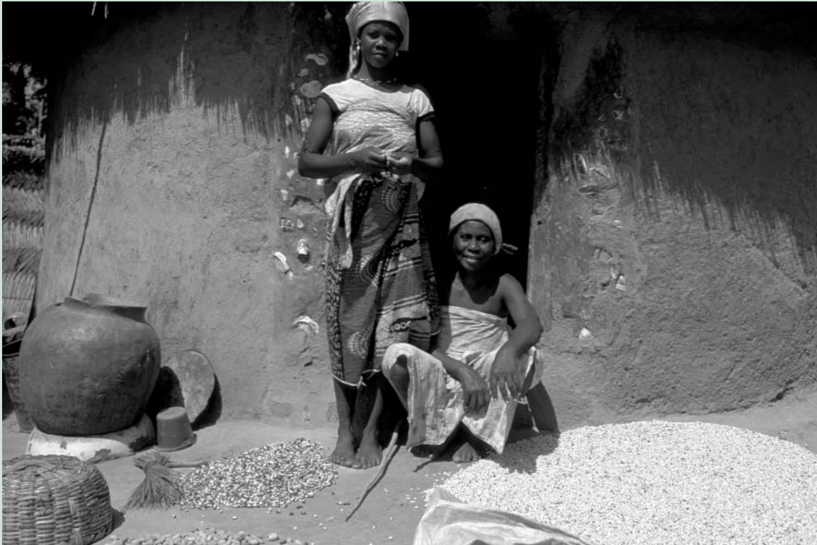
Two women with grain in Ghana.