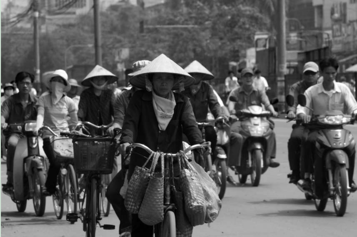
Hanoi, Vietnam, bicycle and scooter riders.