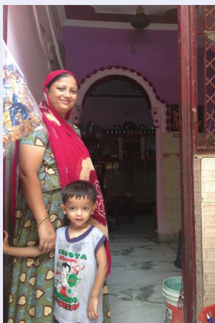
A client of Ujjivan Microfinance Pvt. Ltd., in New Delhi.