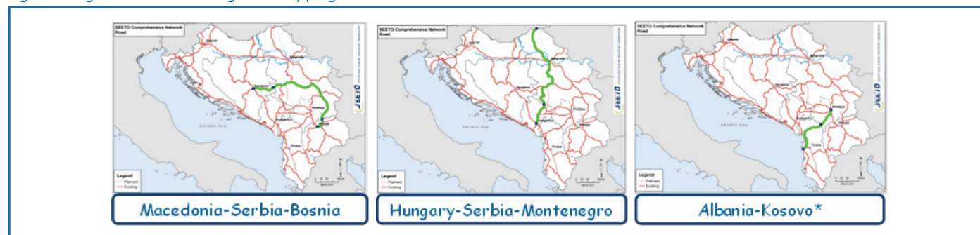
Figure 2: Agribusiness Trade-Logistics Mapping