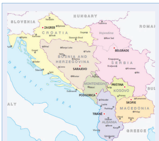
Map of Western Balkans

The project's core focus was to facilitate trade in the Western Balkans by reducing regulatory and administrative constraints related to trade logistics and by streamlining and harmonizing border clearance procedures. Its primary counterparts were the customs administrations and sanitary and phytosanitary (SPS) agencies in the six countries.