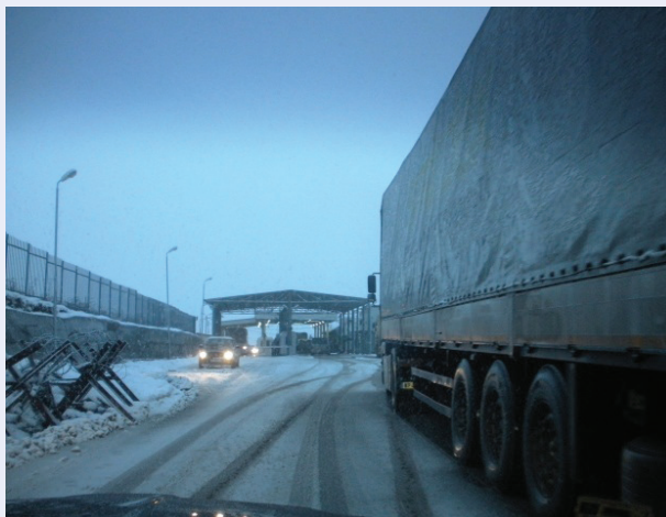
Border-crossing point in the Western Balkans.