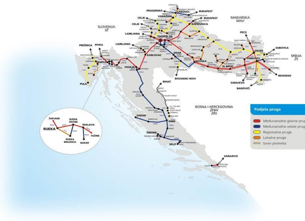
Figure 2: Railway map 2

The institutional reforms have now mostly been completed. However, in recent years, the companies' managements have mostly focused on separation and solving the immediate financial difficulties or bankruptcy (HŽC, and the subsidiaries of HŽI and HŽP) with much less emphasis on the reorganization of services and operations, commercial policy or medium-term planning. Experience in Europe also shows that operational restructuring takes a great deal of time.