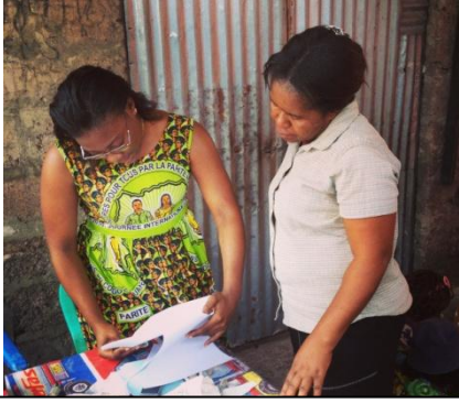
Teachers being trained on how to use the IAI guide