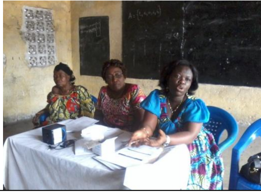
Ministry representatives talking to parents about the potential of IAI

The episodes were then tested in the selected classrooms with groups of 4-5 year old preschool children and their teachers. Testing for each program was followed by a group interview with the children to understand what they liked about the program and what they learned. Teachers were also interviewed to obtain their feedback on each lesson, to integrate into the modifications made to the program post-testing.