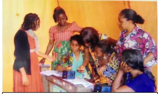
Teachers being trained on how to use the technology

Community members and parents were provided with an orientation session to explain the purpose and goals of the pilot, share some examples of the IAI content, and provide answers to any questions that attendees might have.