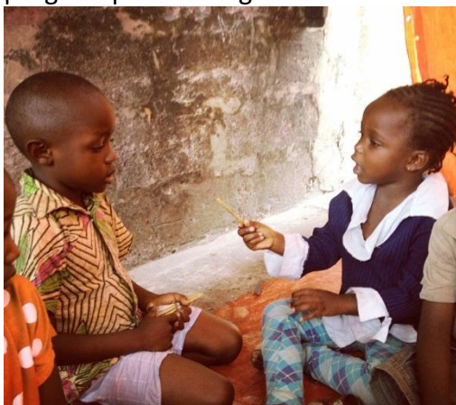
Children using manipulatives during IAI piloting

The episodes were then tested in the selected classrooms with groups of 4-5 year old preschool children and their teachers. Testing for each program was followed by a group interview with the children to understand what they liked about the program and what they learned. Teachers were also interviewed to obtain their feedback on each lesson, to integrate into the modifications made to the program post-testing.