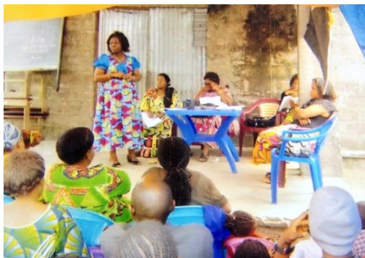
Parents gathered to learn about IAI

Parents' concerns largely revolved around the language employed in the IAI programs (Lingala) because many desired their children to learn in French, which is perceived as the "language of success." To address this concern, Ministry personnel accompanying the team responded by presenting research on the importance of children's early learning in a language they understand and how this contributes to school success later on. Parents seemed satisfied with this response.