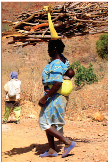
Women gathering firewood

EI often means the conversion of land to new uses – either for extraction itself, or for support infrastructure (roads, ports, housing, clinics, and offices). This can mean the loss of subsistence agriculture and farmlands and cutting off access to resources like water and food. In many countries, men are typically land titleholders, so men are more likely to be the ones compensated for loss of land, even if it is women who work the land and are equally – if not more so – impacted by the loss, in terms of access to fresh water, vegetable gardens, gathering firewood, accessing food, and ceremonial uses. Women may not see much or any of the compensatory money, reducing their resiliency from these changes and their ability to provide for dependent family members.