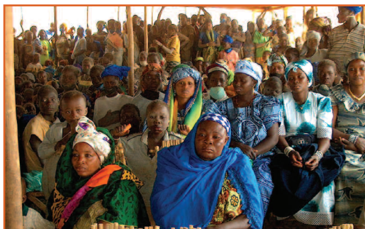
Community consultation in Burkina Faso

Inclusion of women in these consultations is essential to obtaining a valid social license to operate, and to ensuring that use of mining revenue reflects the views and priorities of all community groups and not just the community leadership, who are typically men. Unless the views of all groups are obtained, priorities may not meet the needs of the