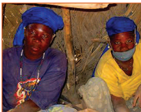
Artisanal miners in Burkina Faso

Small-scale miners are typically paid based on delivery of product, so women may work all day, but earn little cash income, and still be responsible for additional work and responsibilities at home. 56 Working in communities where there are often few, if any other cash generating alternatives, women may work extreme hours, including at night, and even while heavily pregnant, but with no benefits or security. 57 Furthermore, even in artisanal mines, women may have little control over resources. 58 Evidence indicates that women often work longer hours than men, but