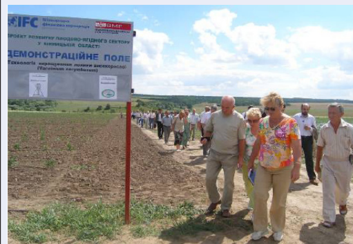
Pictured here is a group of farmers on their way to a seminar held at one of the project's demonstration fields.

The project aims to streamline the company's fruit supply with a group of pilot farms. However, in addition to these activities it conducts an extensive public education campaign in the region and beyond. A dedicated public education specialist is on board to leverage the achievements at pilot farms by highlighting the potential benefits to other farmers and stakeholders. As a result, since the beginning of the project, the number of hectares of new orchards established in the region has grown from 470 in 2005 to 740 in 2007.