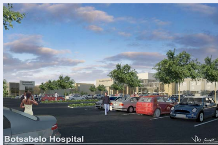
An architect's drawing of the design for the new hospital.

The challenge was to come up with a bid evaluation structure to accommodate three competing objectives: 1) to procure as many services for as many people at the hospital and filter clinics as possible; 2) to improve the quality of services; and 3) to do so within the government's affordability limit. The best structure we could devise to balance these objectives involved dividing the technical evaluation into three areas: